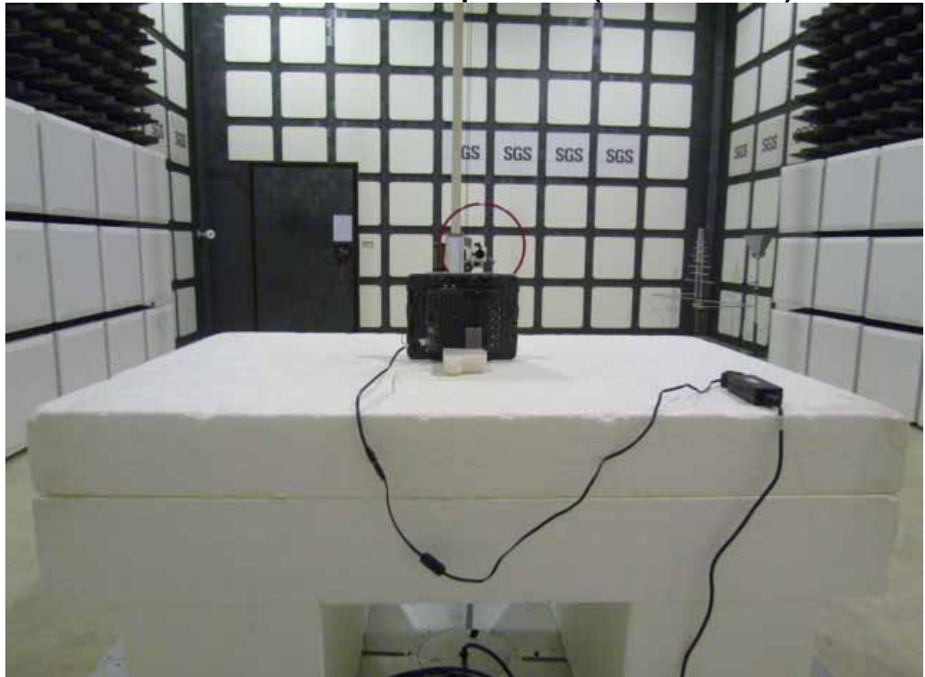
Radiated Emission Setup Photos (Below 30MHz)

Radiated Emission Setup Photos (30MHz~1GHz)