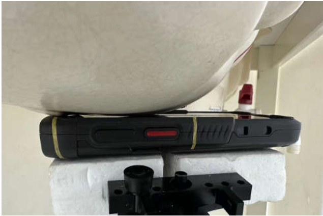
Right Cheek, Test Separation 0 mm