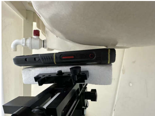
Left Tilted, Test Separation 0 mm