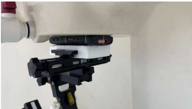
Front, Test Separation 0 mm