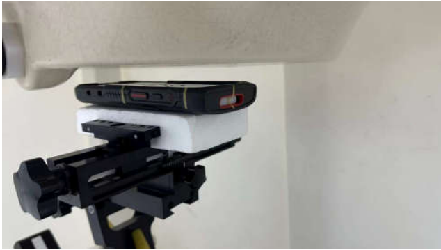
Front, Test Separation 15 mm