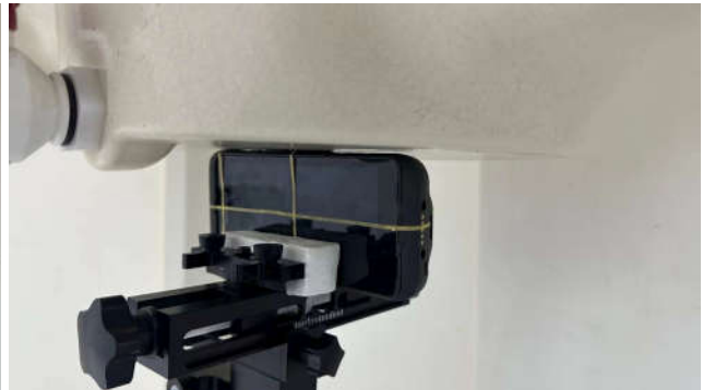
Right Side, Test Separation 0 mm