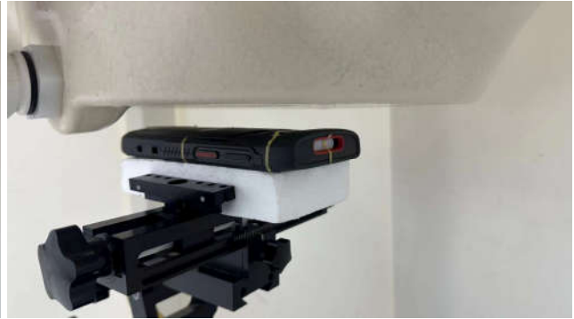
Back, Test Separation 15 mm