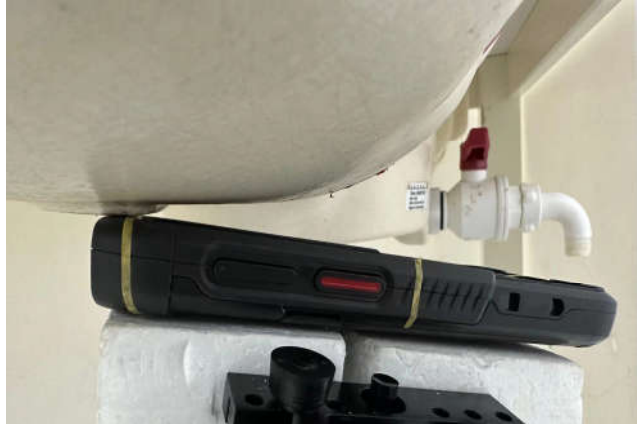
Right Tilted, Test Separation 0 mm