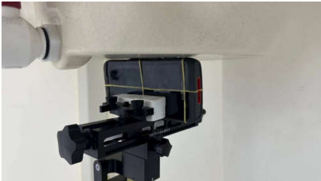
Left Side, Test Separation 0 mm