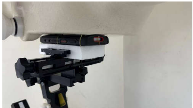
Back, Test Separation 0 mm