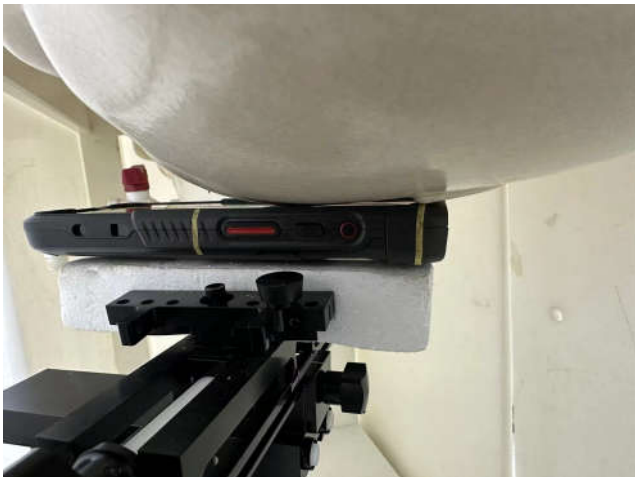
Left Cheek, Test Separation 0 mm