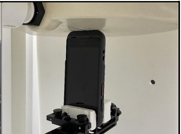
Bottom Side of EUT with 0 cm Gap