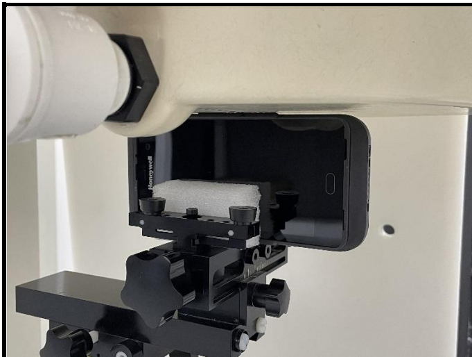
Right Side of EUT with 0 cm Gap