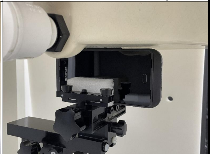
Right Side of EUT with 0 cm Gap