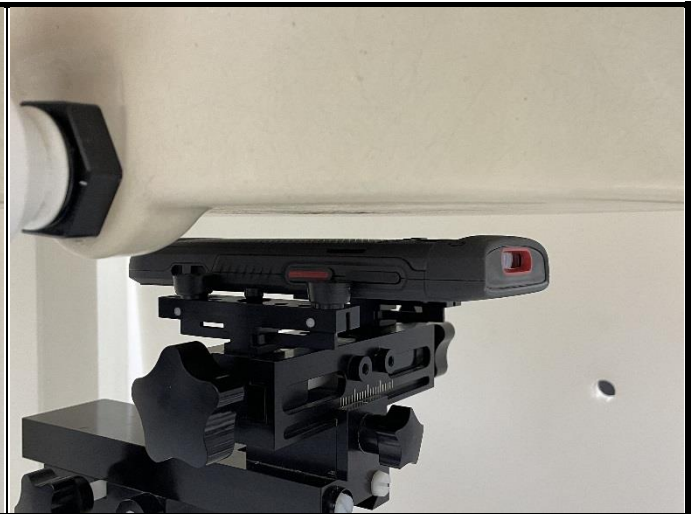
Rear Face of EUT with 1.0 cm Gap