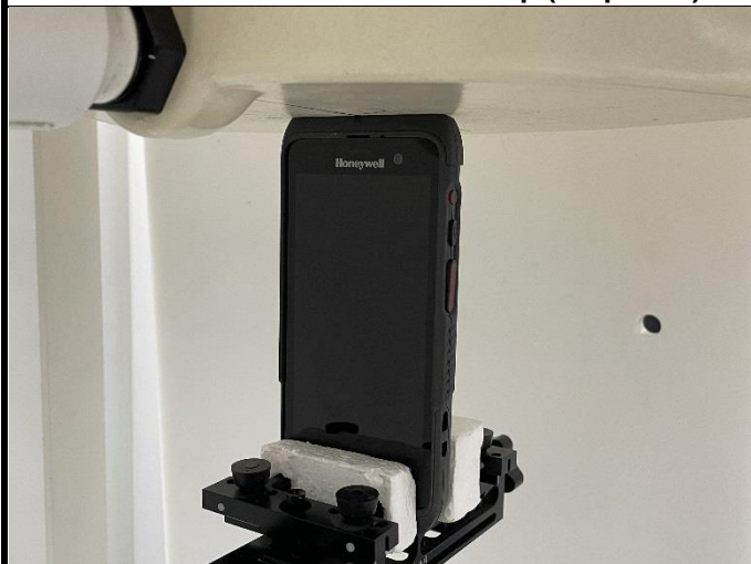
Top Side of EUT with 0 cm Gap