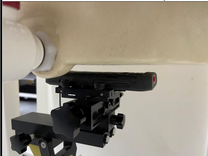
Rear Face of EUT with 1.0 cm Gap (Earphone)