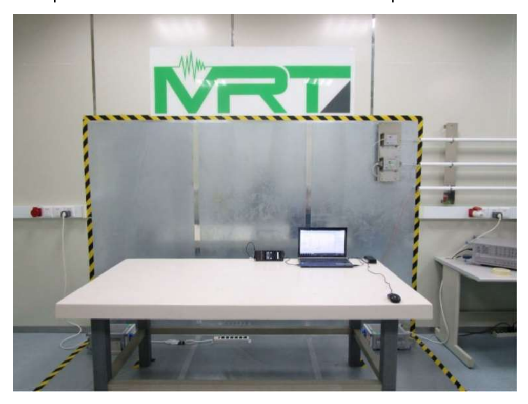
Test Mode 1 Description: Back View of Conducted Emission Test Setup

Description: Front View of Conducted Emission Test Setup