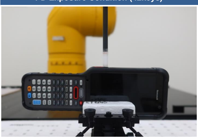
Left Side at 2 mm