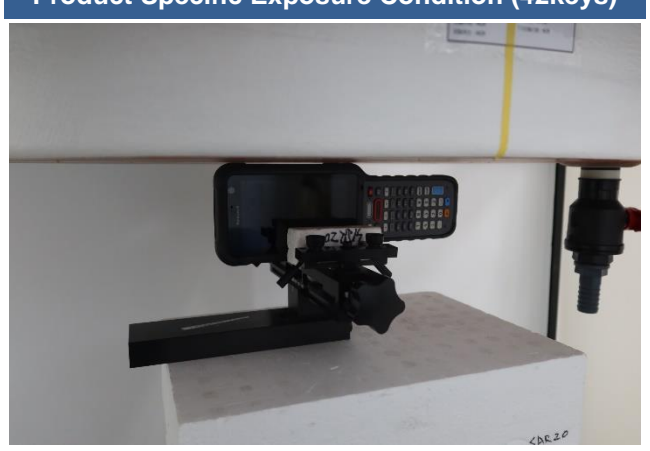
Right Side at 0 mm