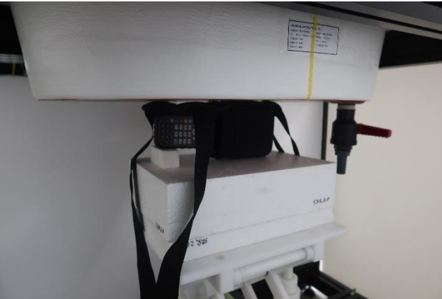
Left Side with Holster 2 at 0 mm