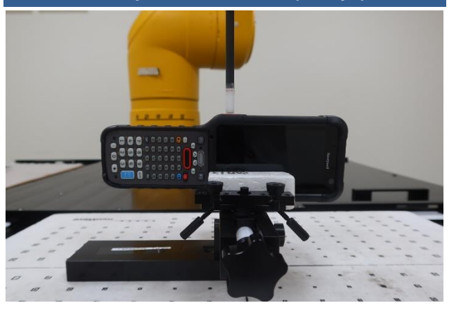
Left Side at 2 mm