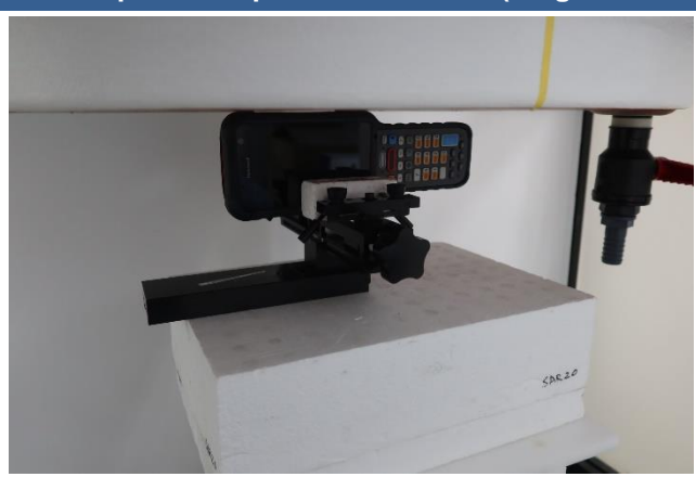
Right Side at 0 mm