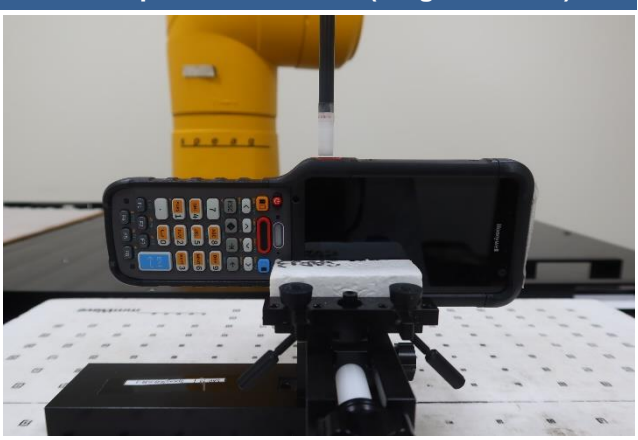
Left Side at 2 mm