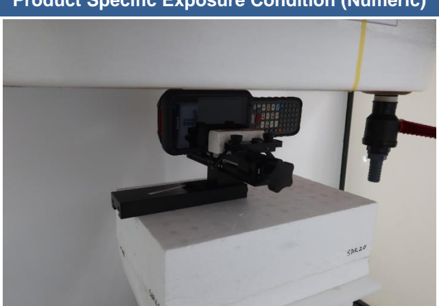
Right Side at 0 mm