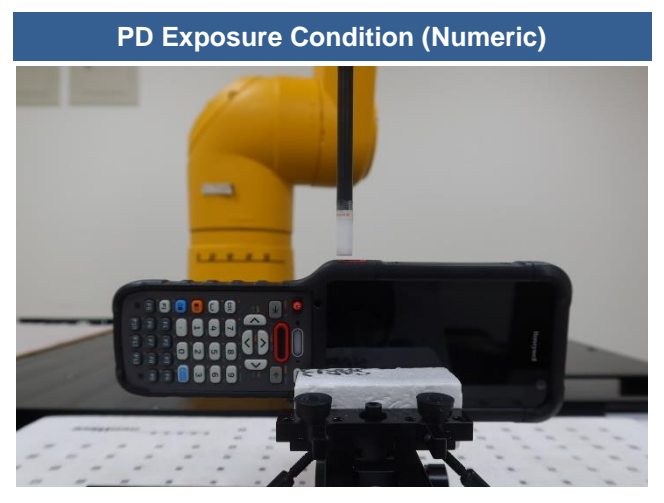
Left Side at 2 mm