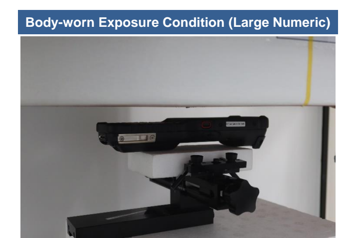
Front at 15 mm