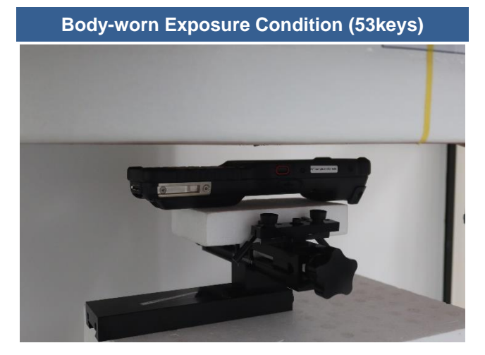
Front at 15 mm