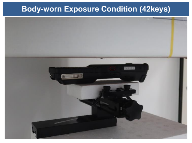
Front at 15 mm