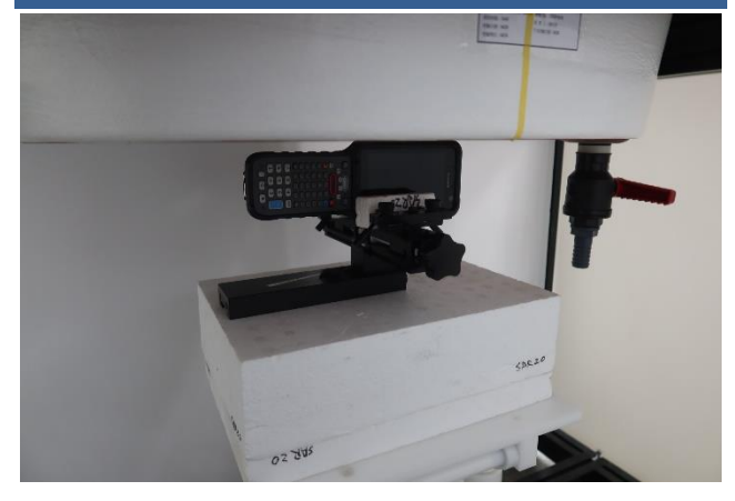
Right Side at 0 mm