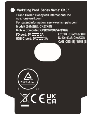
WLAN SKU (Std. Alpha)