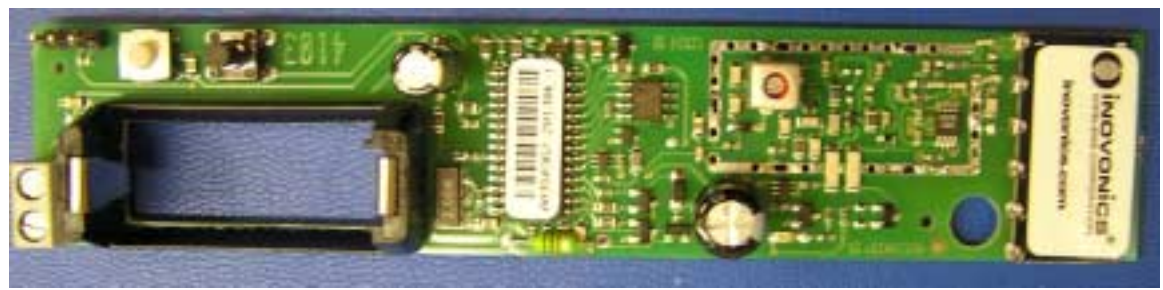
Photograph of the FA-250M board with the shield removed.