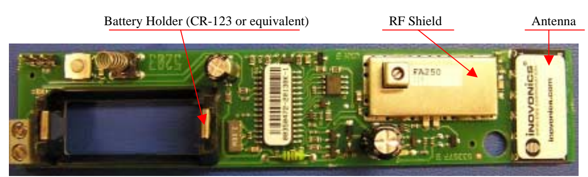
Photograph of an FA-250M board with the shield in place. Note PC mounted antenna is at the far right end of the board.