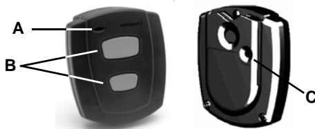
Figure 1 Transmitter external components

A Transmit LED B Activation buttons C Reset button