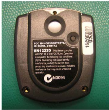
Back of product showing FCC ID Number