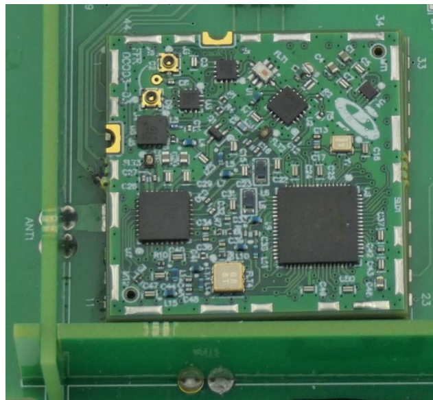
Top View with Shield Can