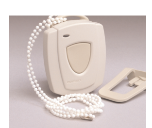
Figure 6: ES1223S with neck cord