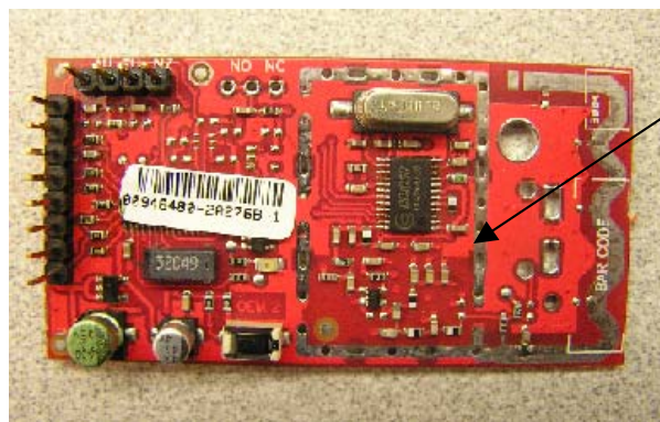
With shield can removed