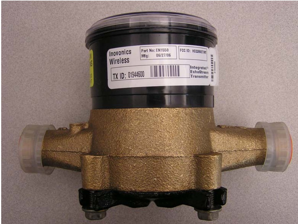
Unit Installed on Brass Water Meter – side view