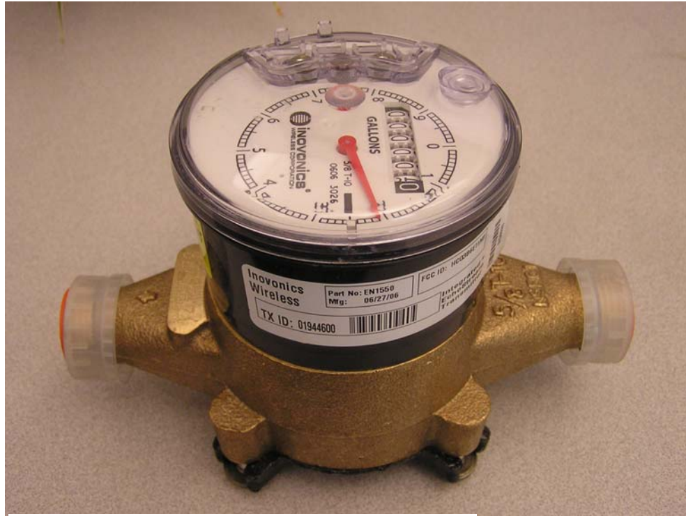
Unit Installed on Brass Water Meter