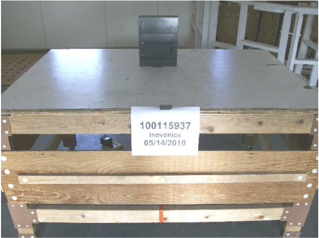
Radiated Emissions Test setup – Front View