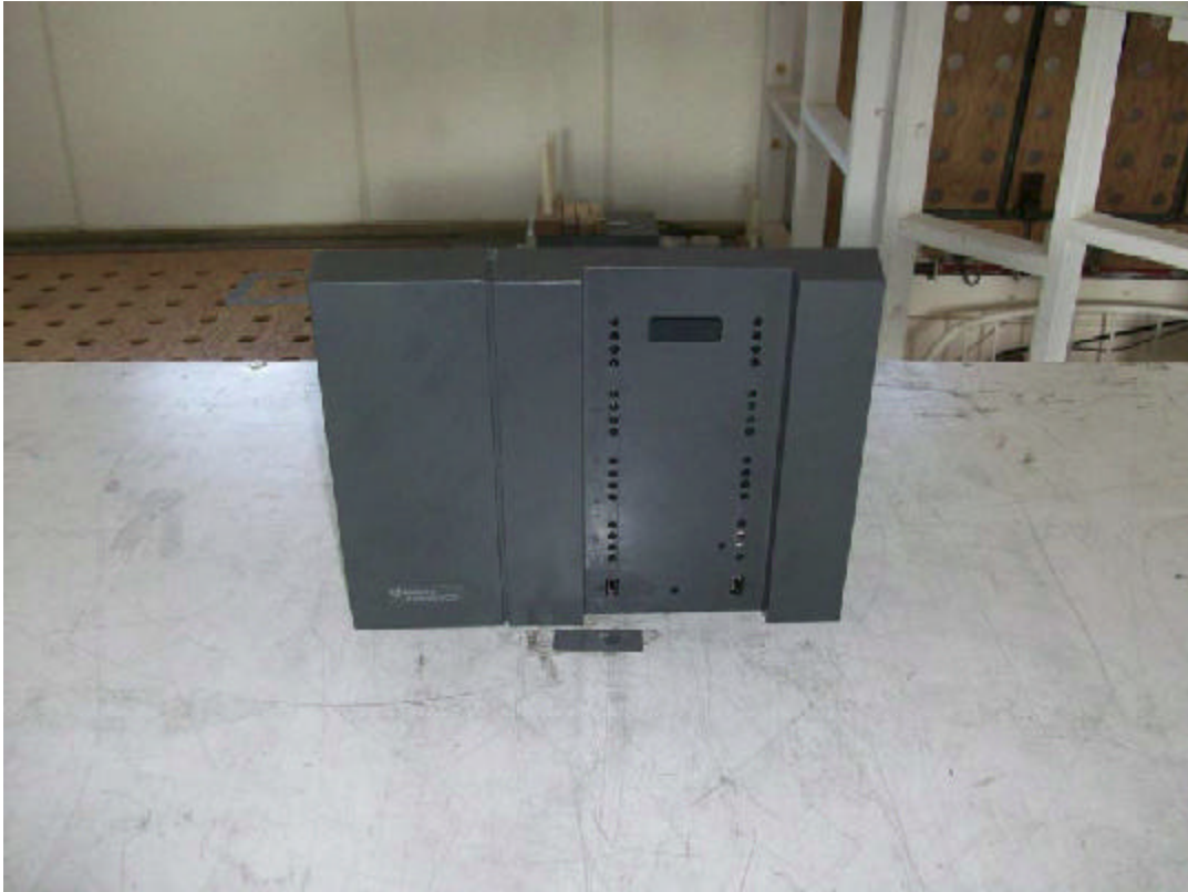
Test setup – Axis 2 (EUT Vertical)