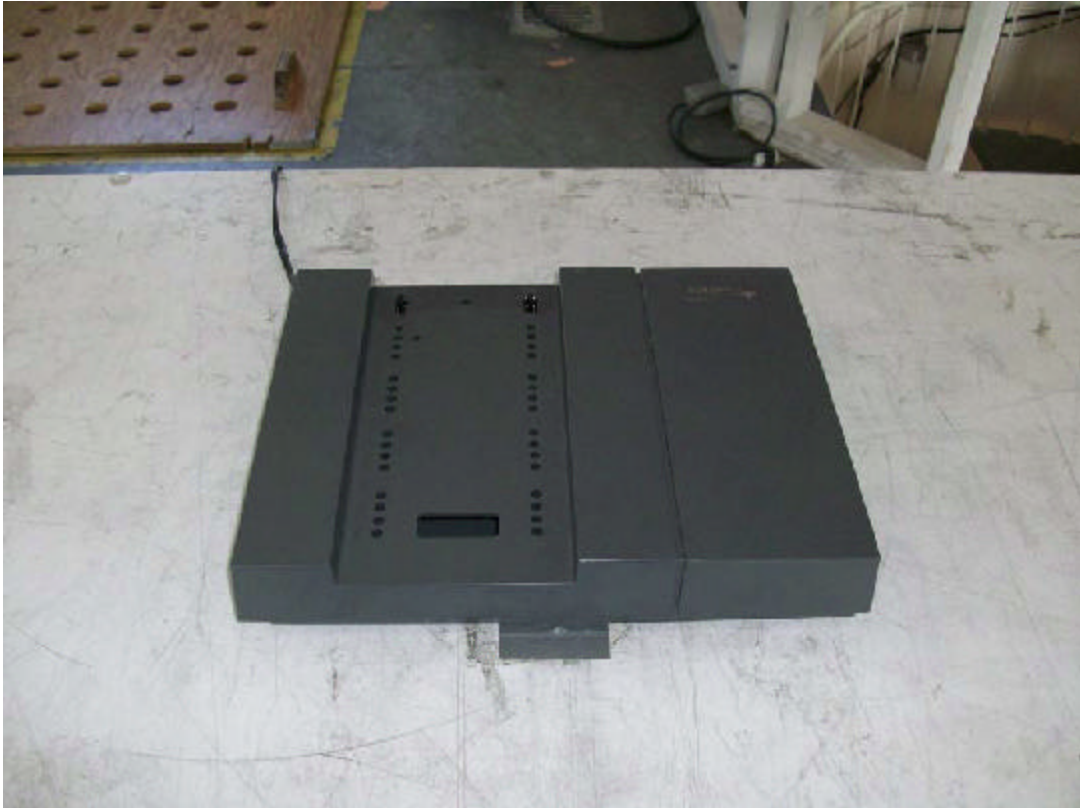
Test setup – Axis 1 (EUT Flat on Table)