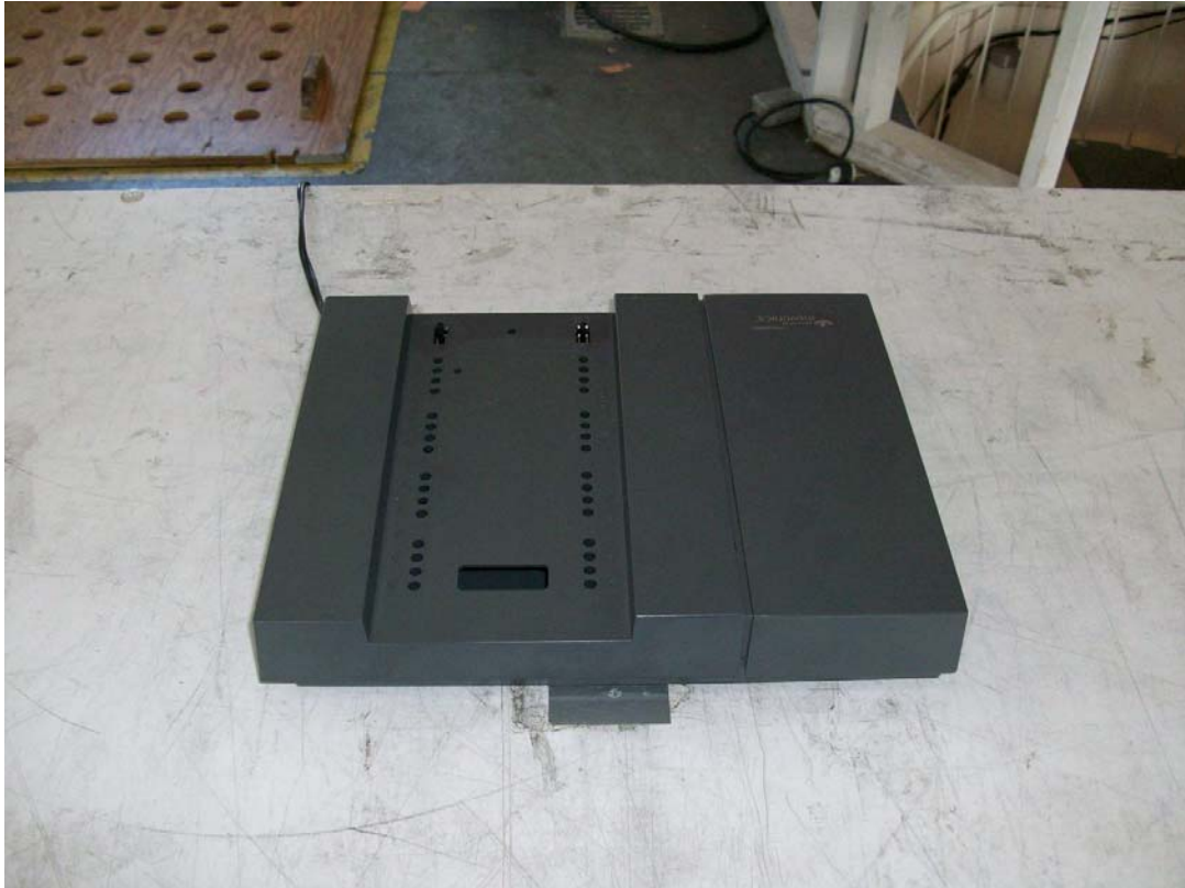
Test setup – Axis 1 (EUT Flat on Table)