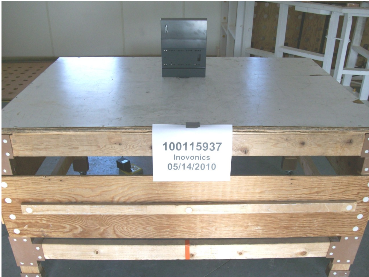
Radiated Emissions Test setup – Front View