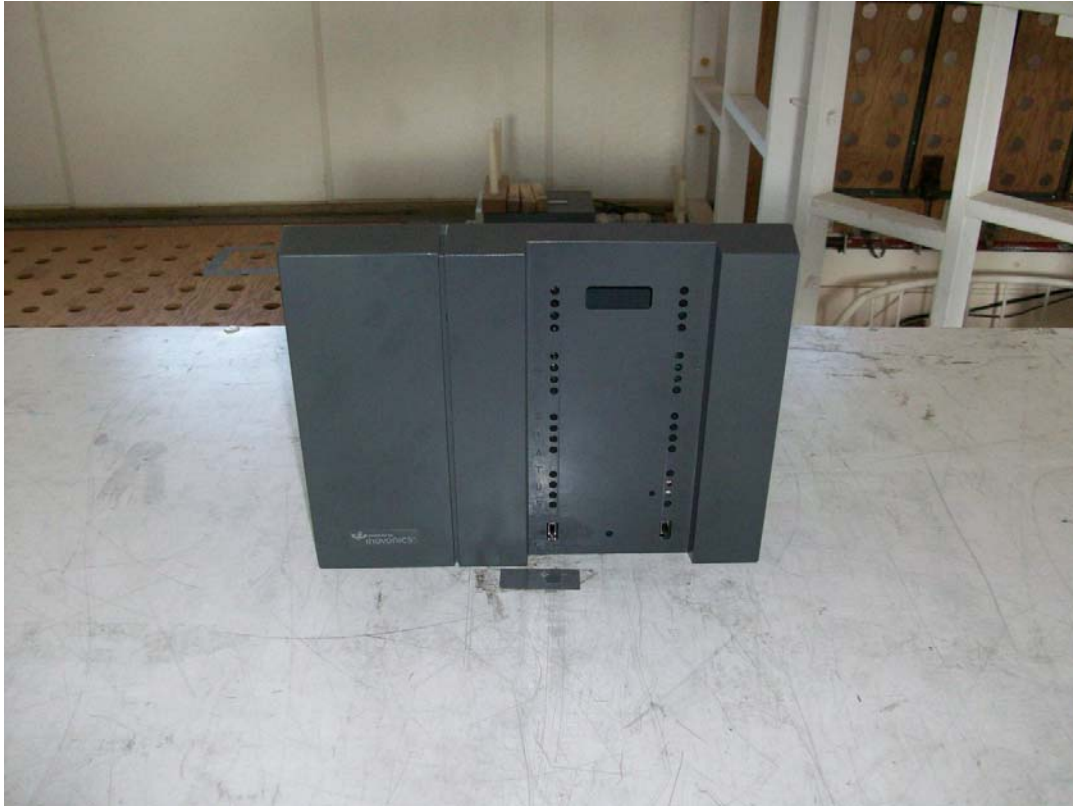
Test setup – Axis 2 (EUT Vertical)