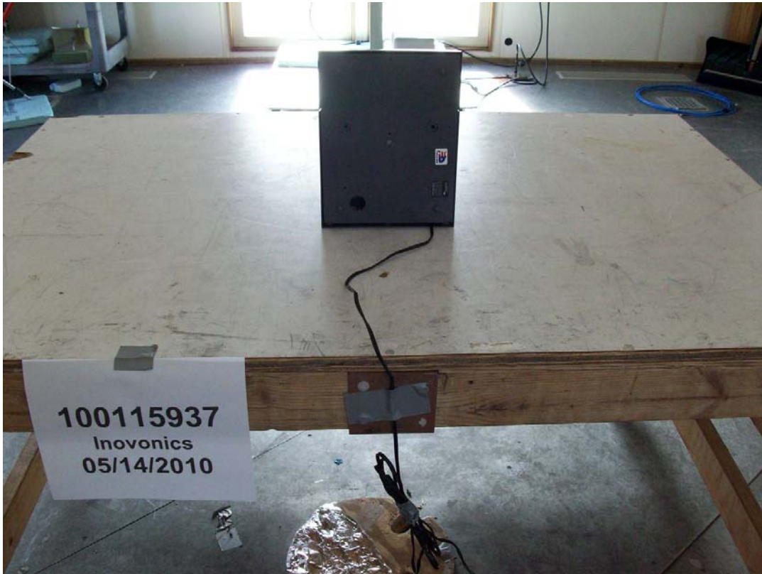
Radiated Emissions Test setup – Rear View