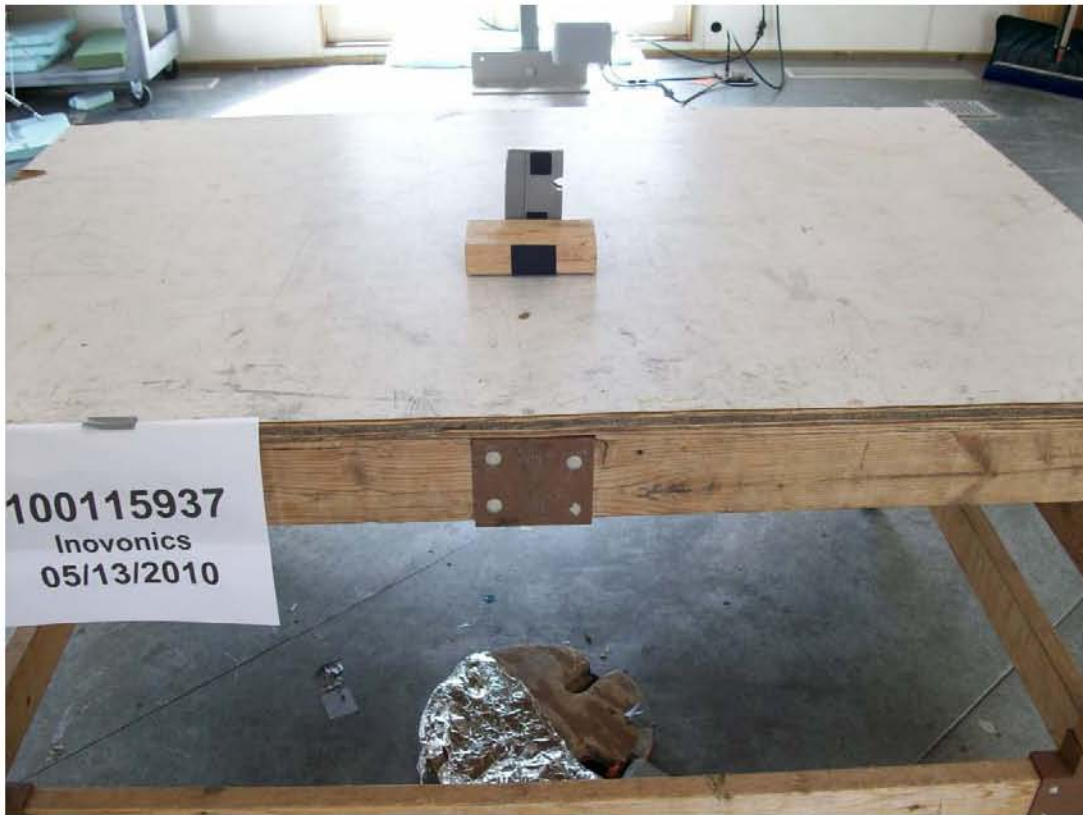
Radiated Emissions Test setup – Rear View