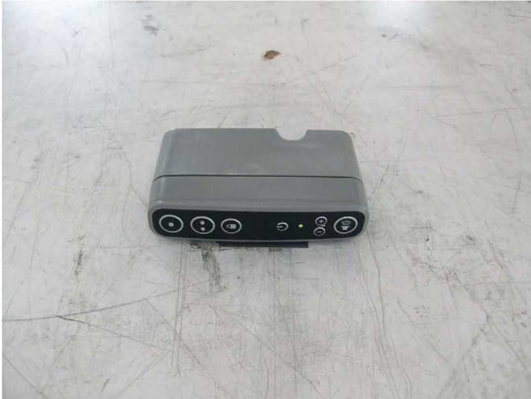
Test setup – Axis 1 (EUT Flat on Table)