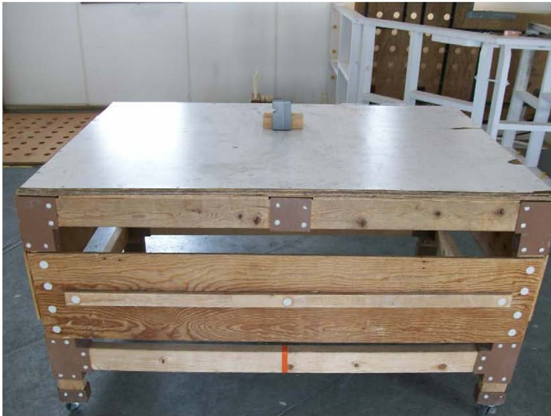
Radiated Emissions Test setup – Front View