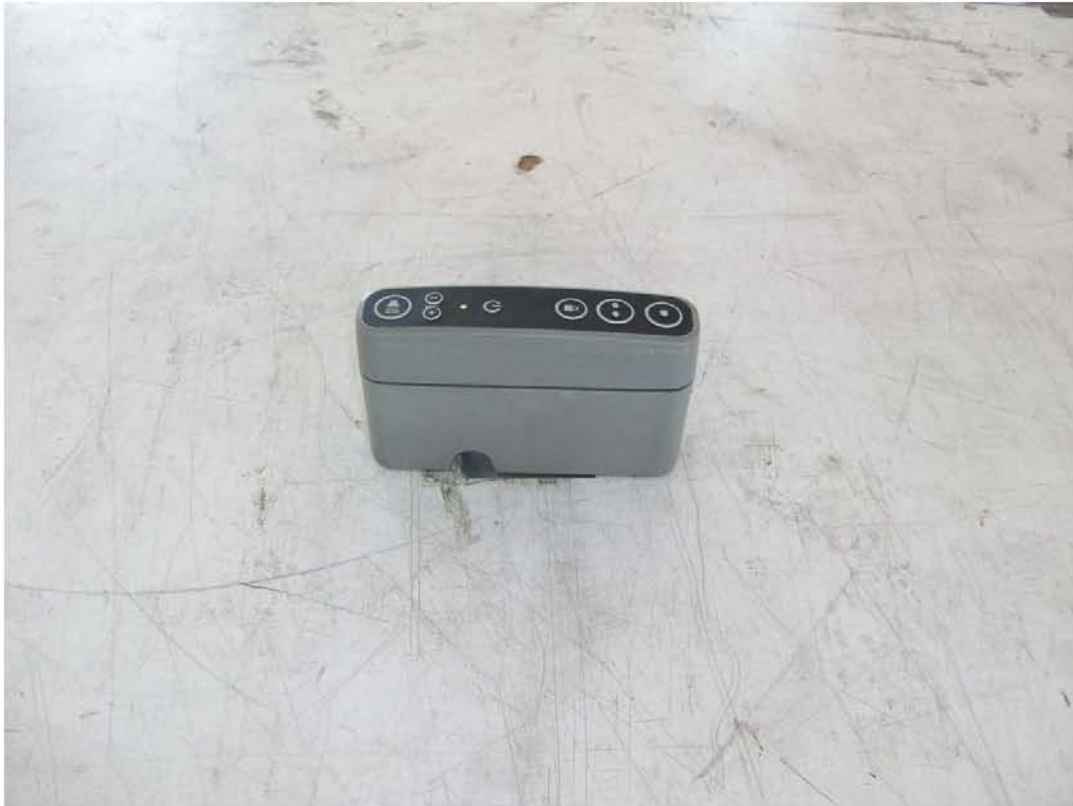
Test setup – Axis 2 (EUT Vertical)