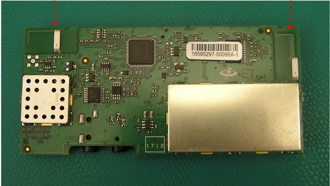
PCB FRONT with SHIELD