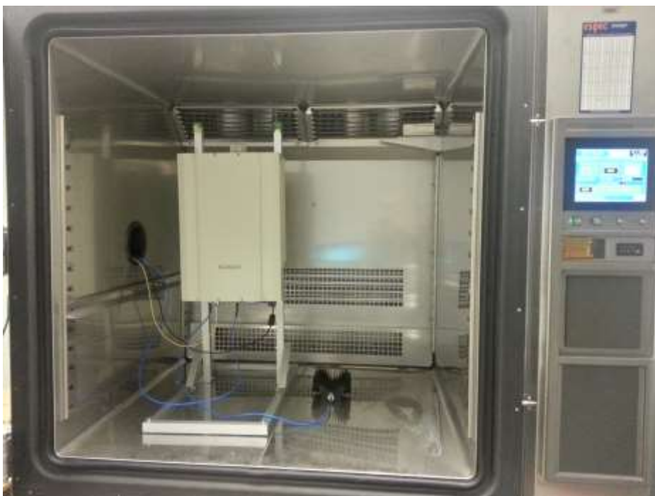
Figure 1 Conducted Test Setup – EUT