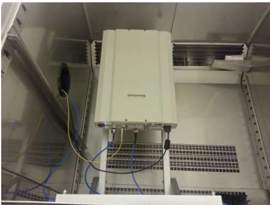
Figure 2 Conducted Test Setup – EUT Close Up