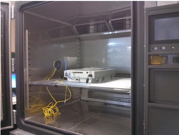
Figure 2 Conducted Test Setup – EUT in Temperature Chamber