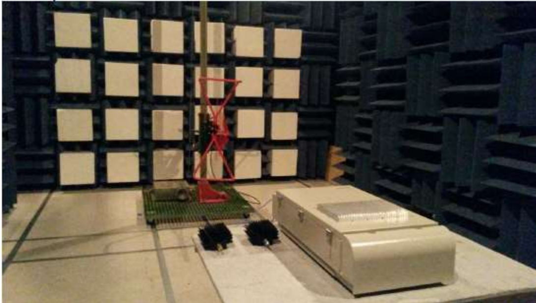
Figure 1: EUT Top View