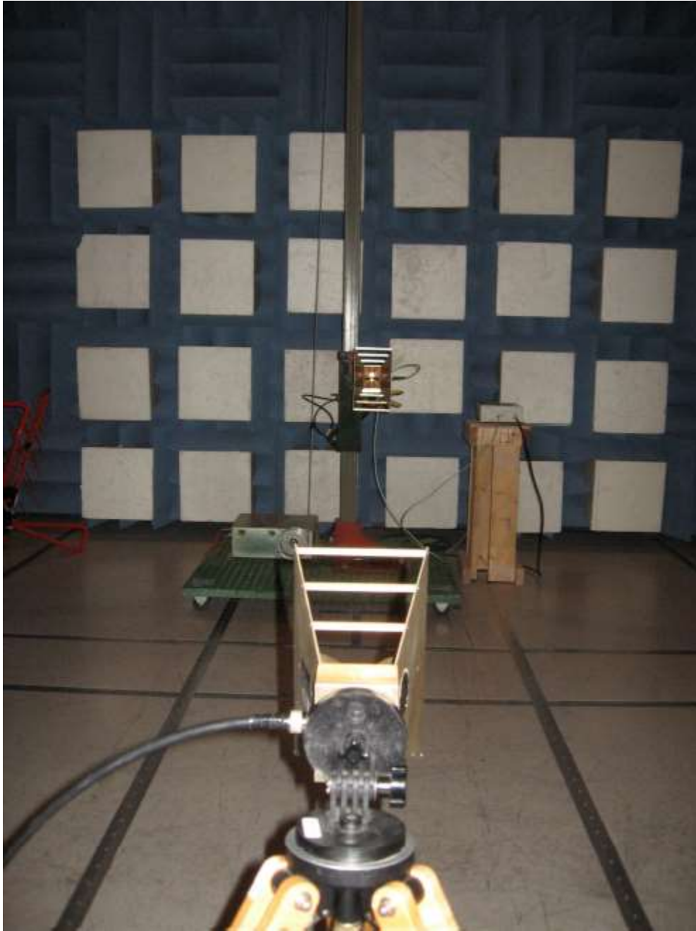
Figure 5: High Frequency measurements - Radiated Emissions Test Setup