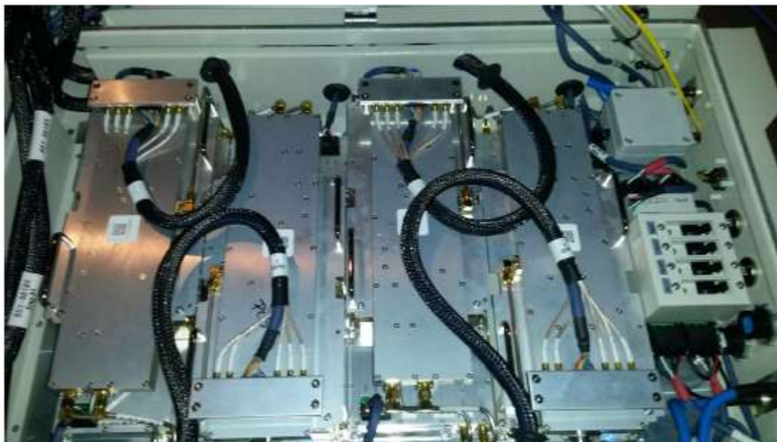
Figure 2: EUT Top View