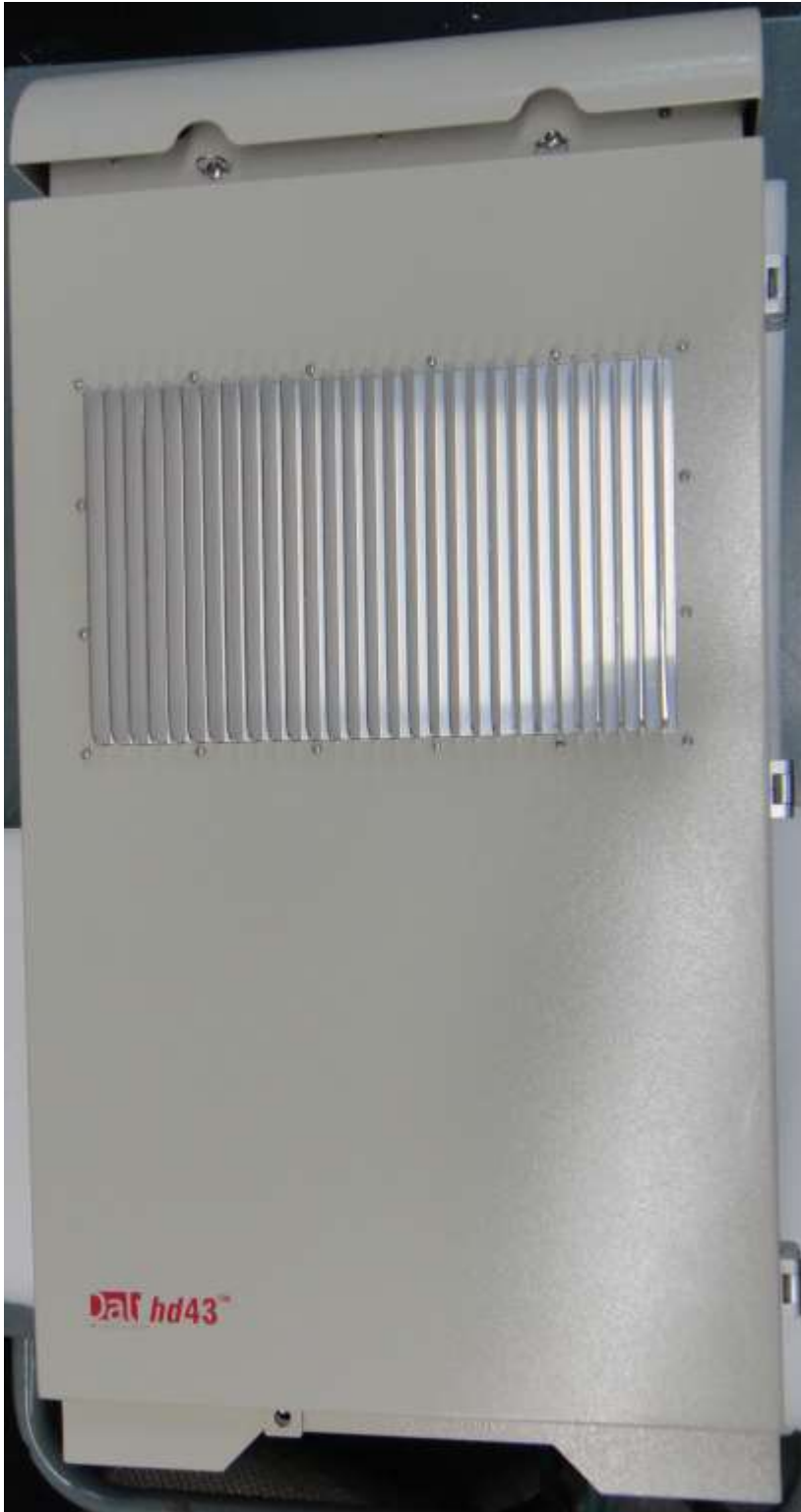
Figure 7: Conducted Test Setup - EUT