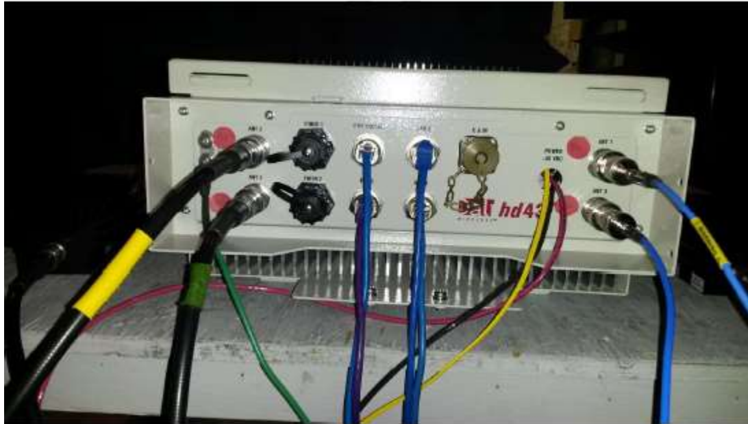
Figure 3: EUT Top View