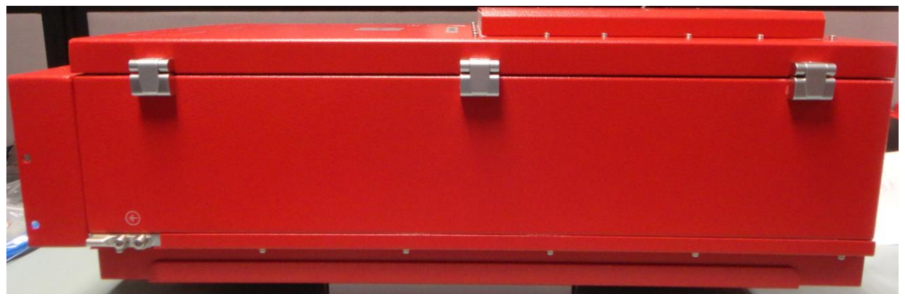
Figure 4: Side view