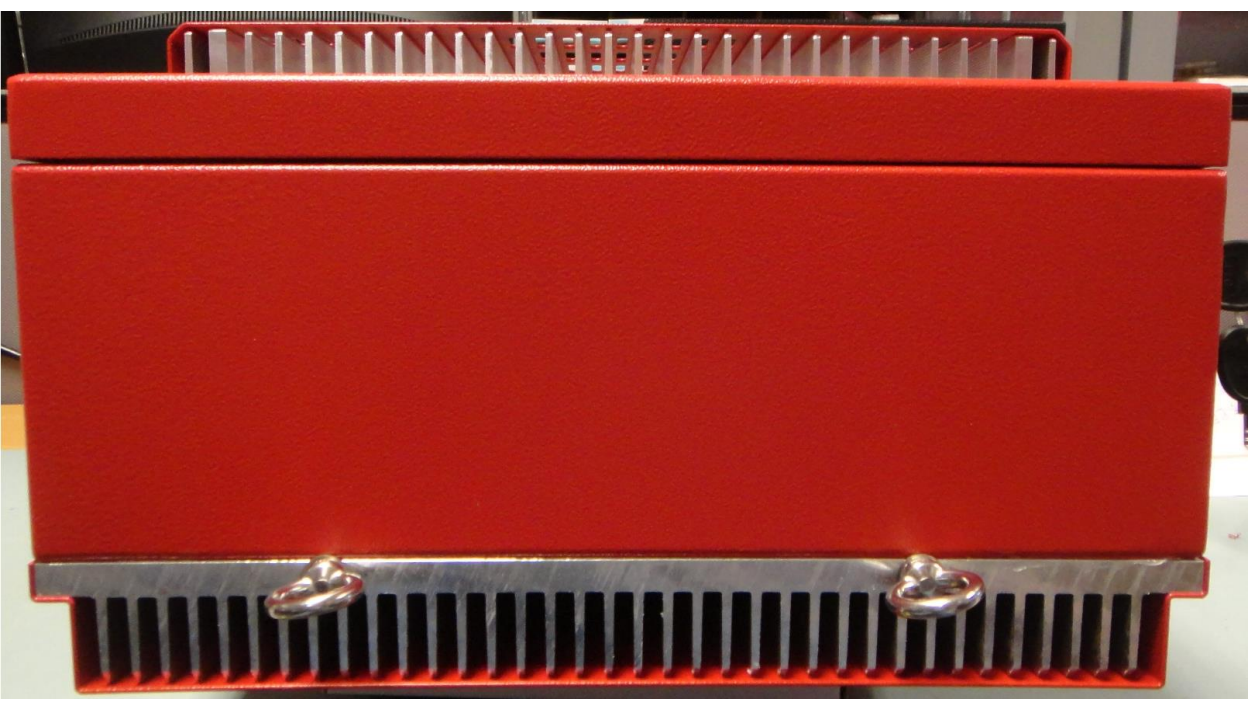
Figure 6: Top view