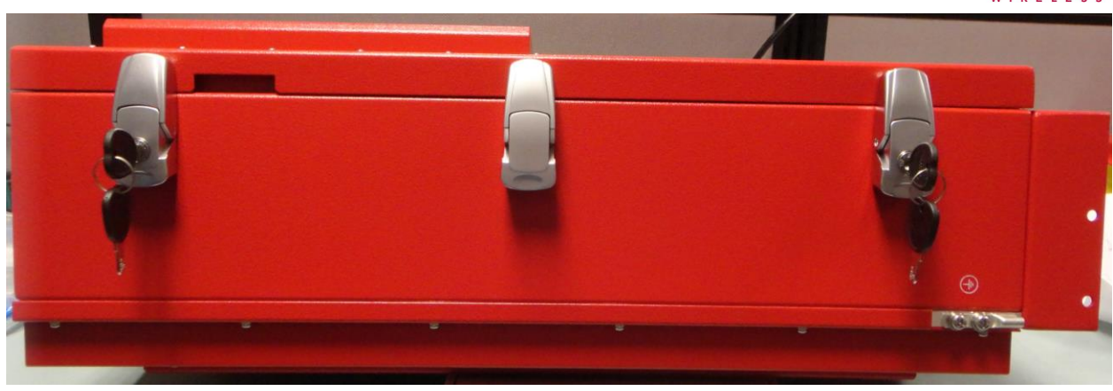
Figure 3: Side view