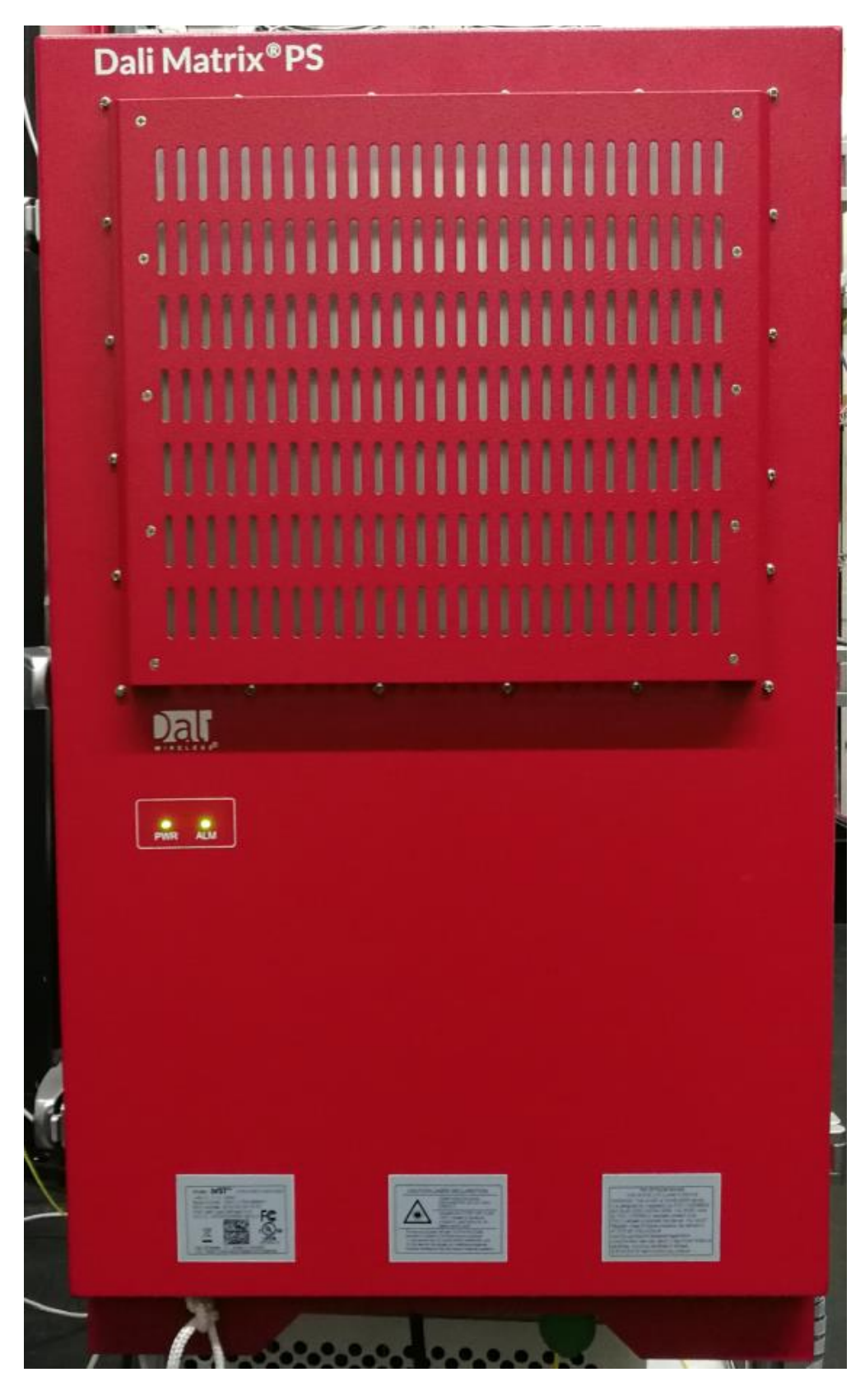
Figure 1: Front view