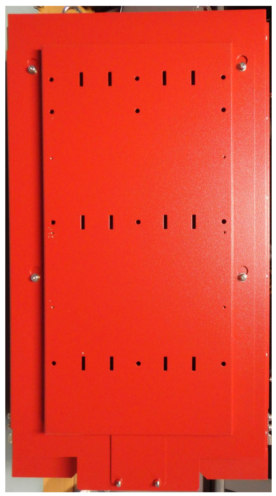
Figure 2: Back view