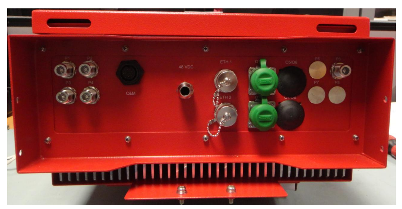
Figure 5: Connector panel view