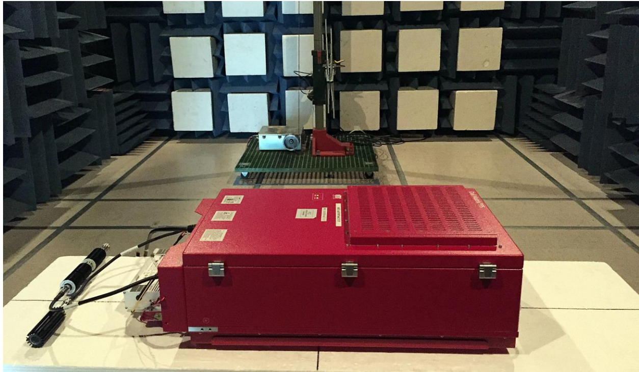
Figure 1: Radiated Emissions (Above 1GHz) Test Setup