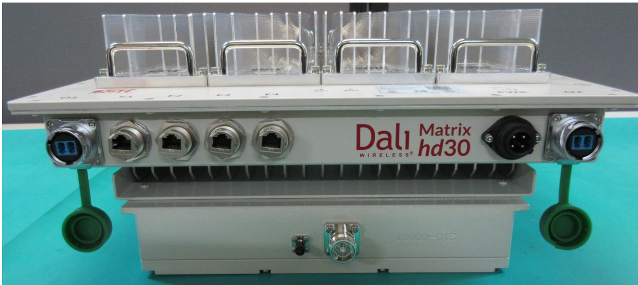
Figure 5: hd30 Connector panel view