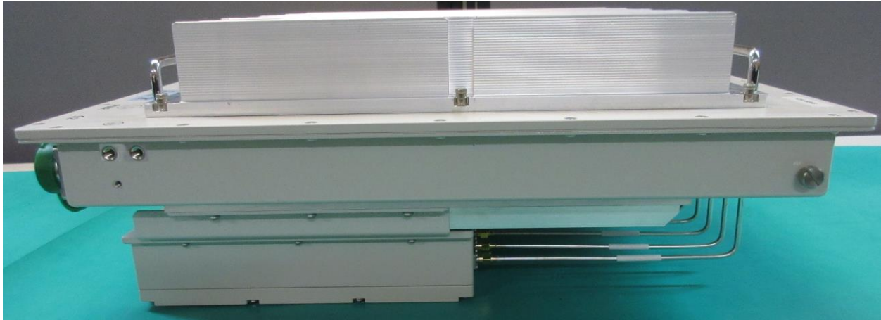
Figure 3: hd30 Side view