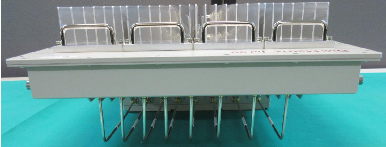
Figure 6: hd30 Top view