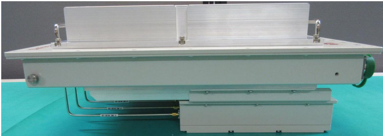
Figure 4: hd30 Side view