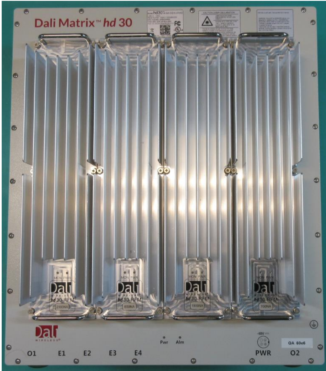
Figure 1: hd30 Front view