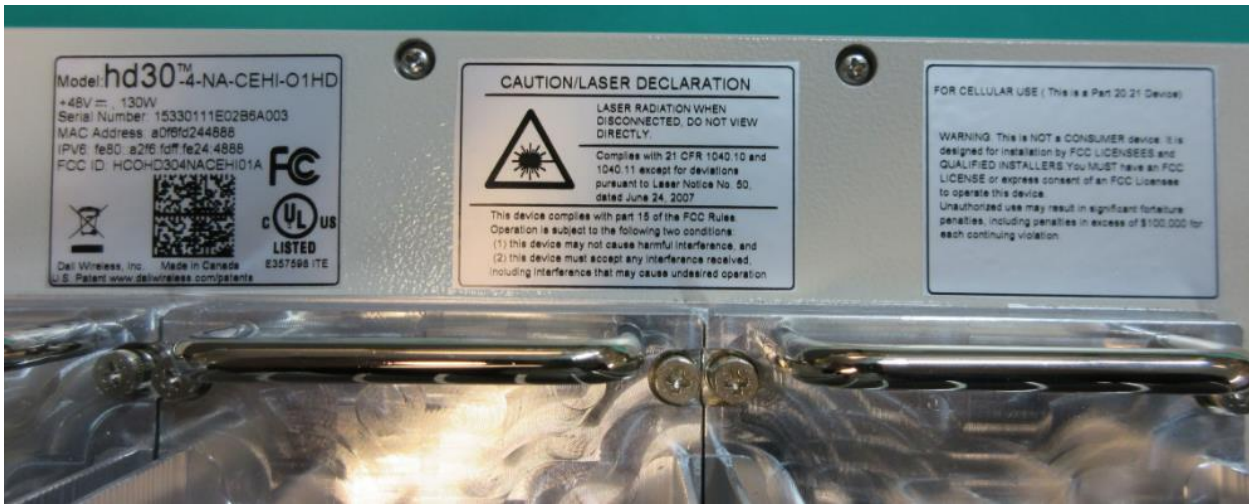
Figure 6: hd30 Labels view