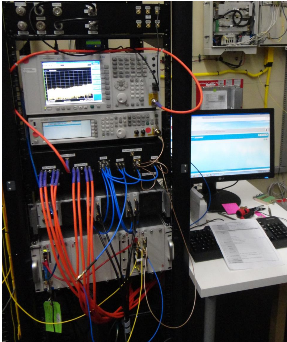
Figure 5: Conducted Test Setup – EUT