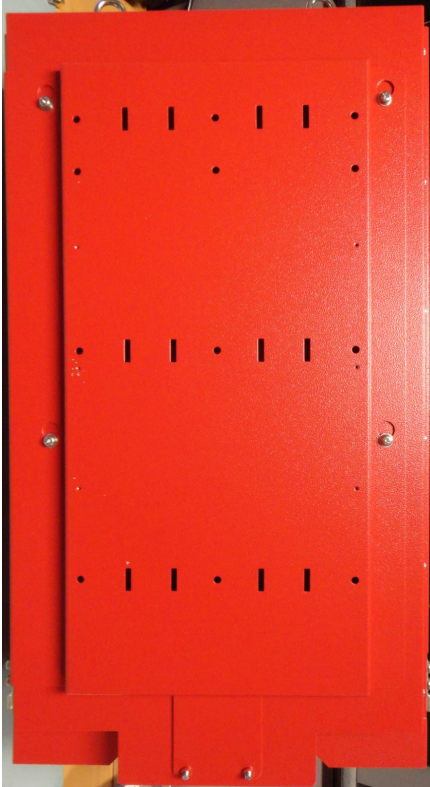
Figure 2: Back view