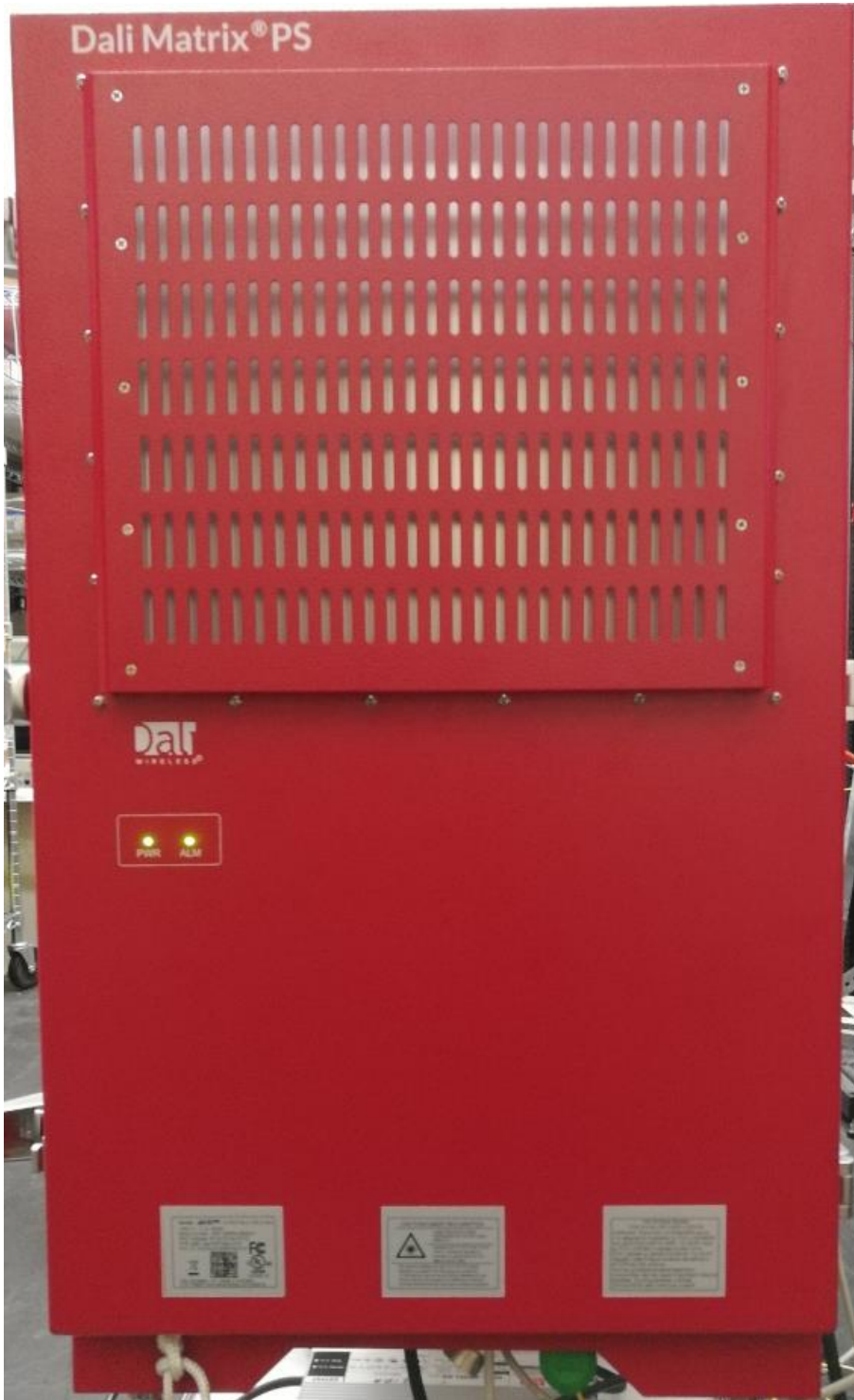
Figure 1: Front view