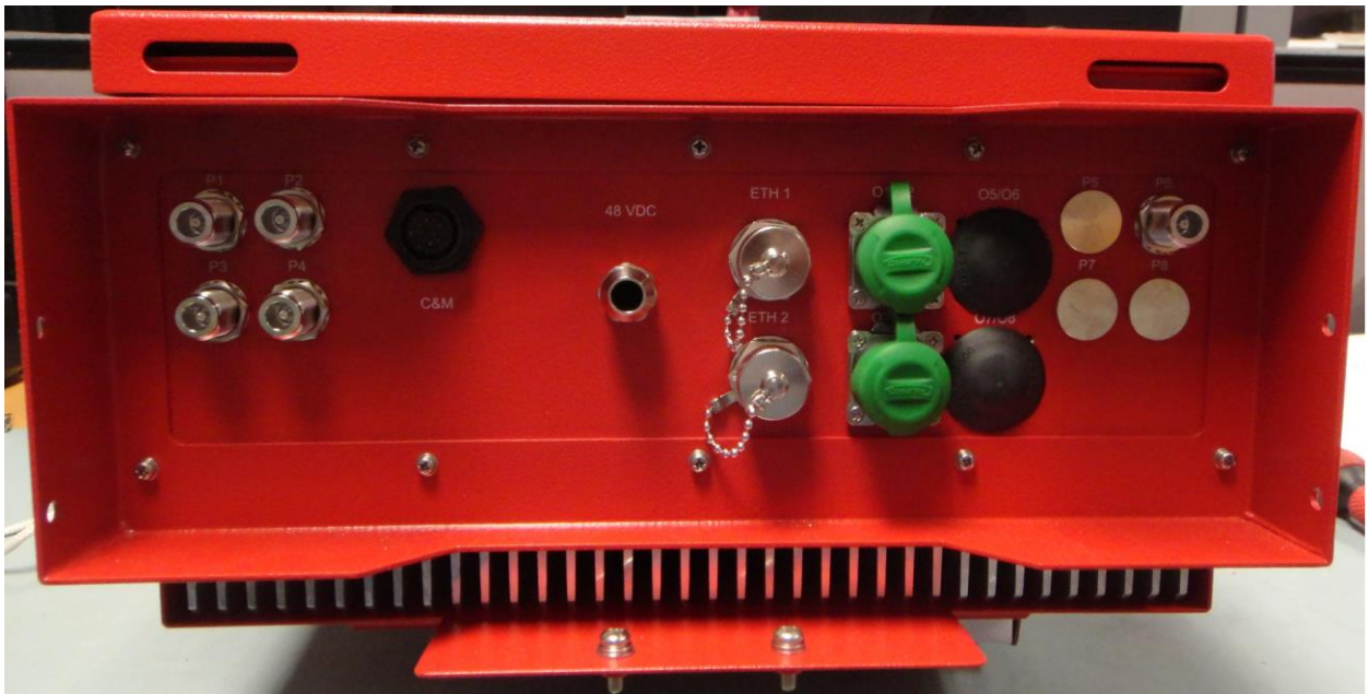
Figure 5: Connector panel view