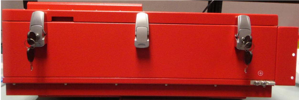
Figure 3: Side view