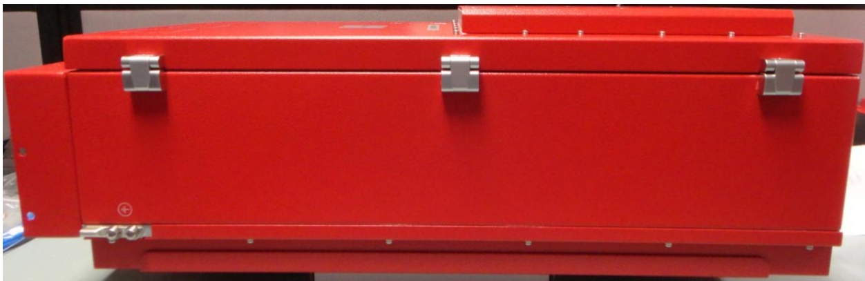
Figure 4: Side view