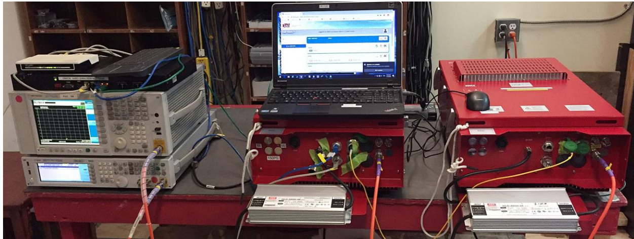
Figure 2: Radiated Emissions (30 to 250MHz) Test Setup