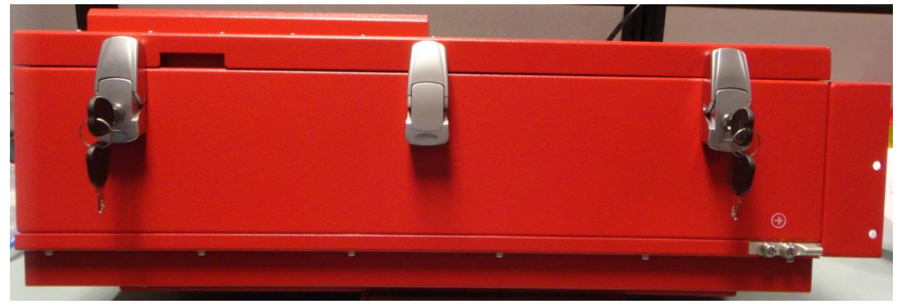
Figure 3: Side view