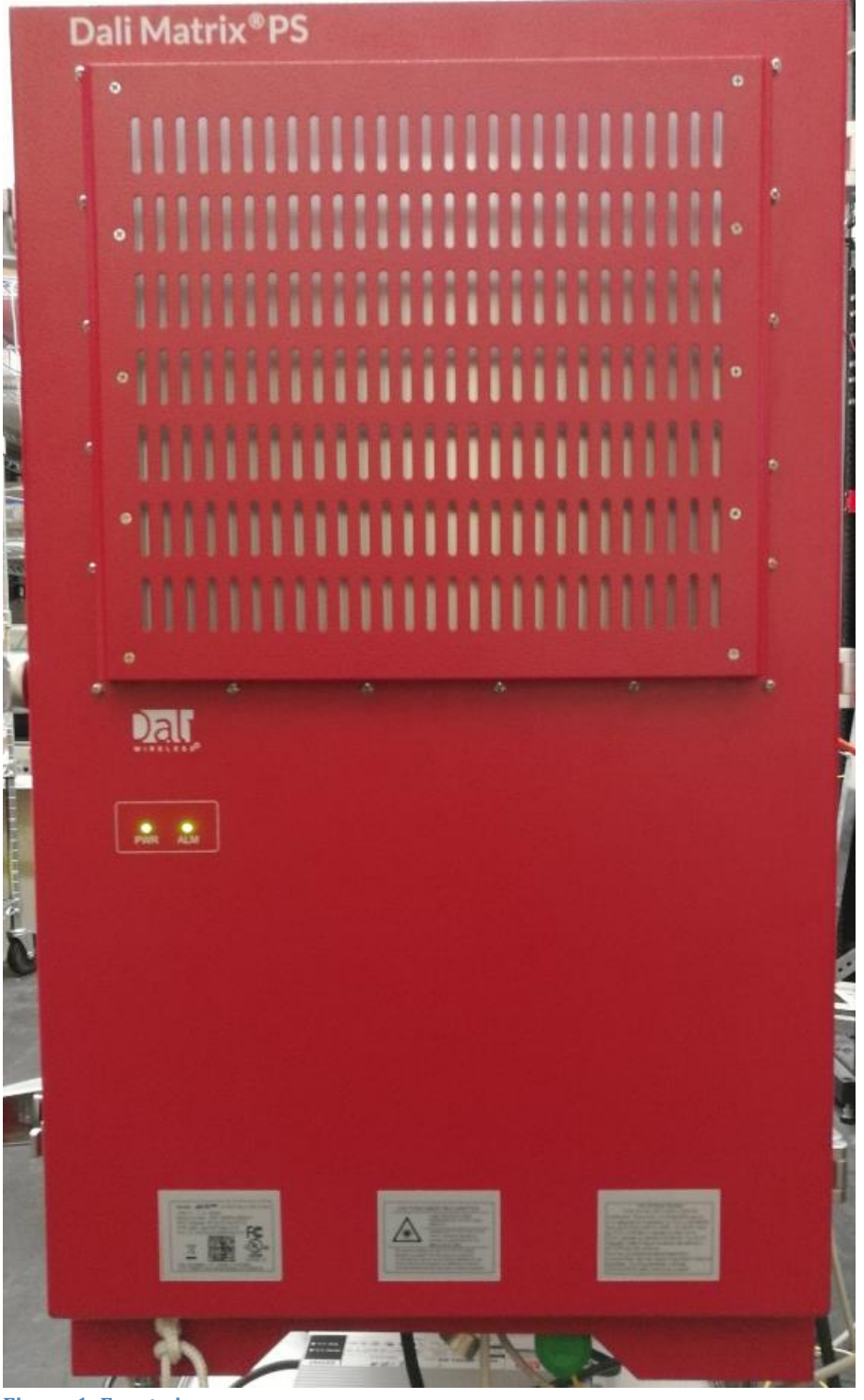
Figure 1: Front view