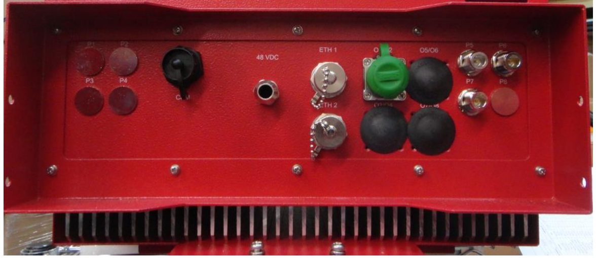
Figure 5: Connector panel view