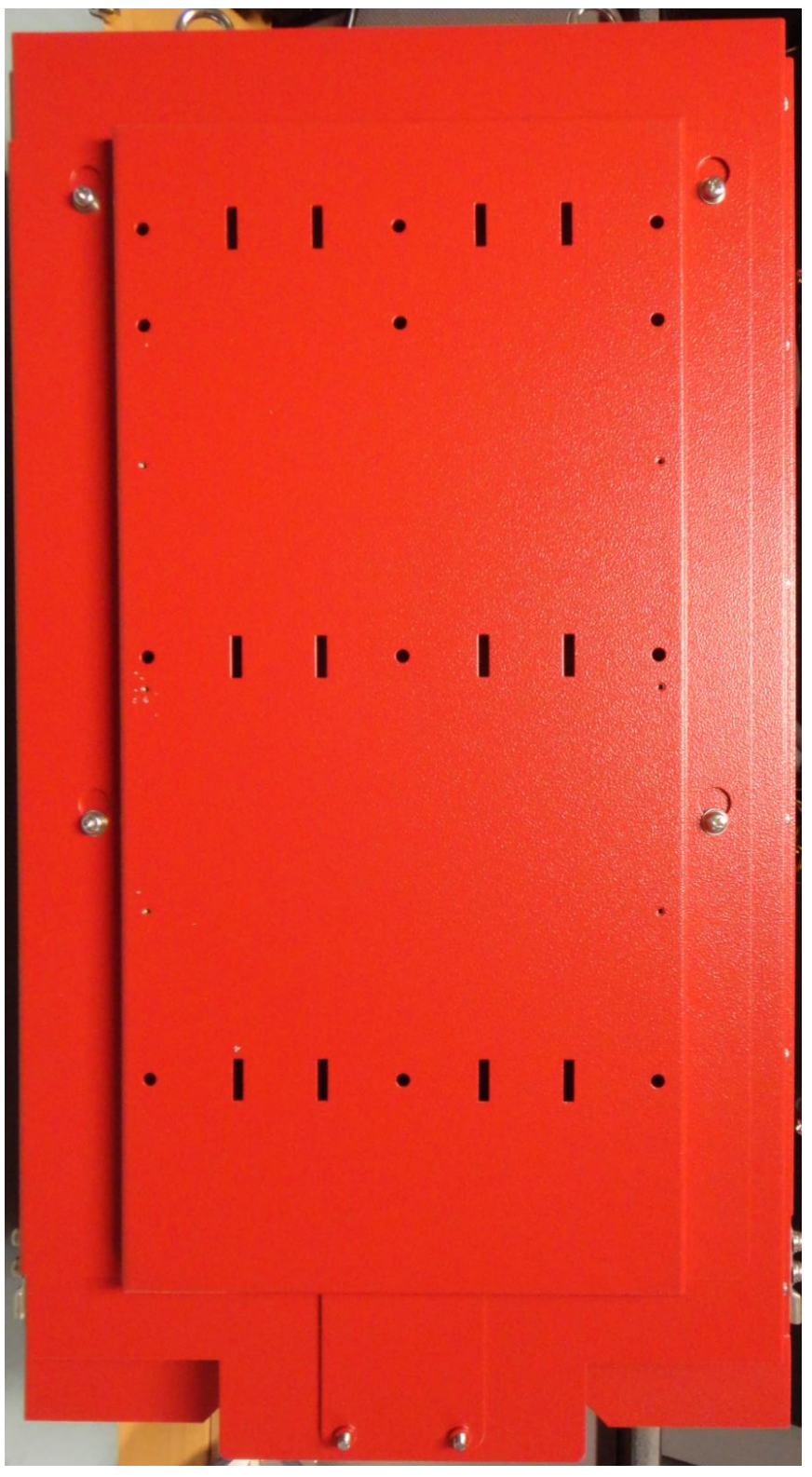
Figure 2: Back view