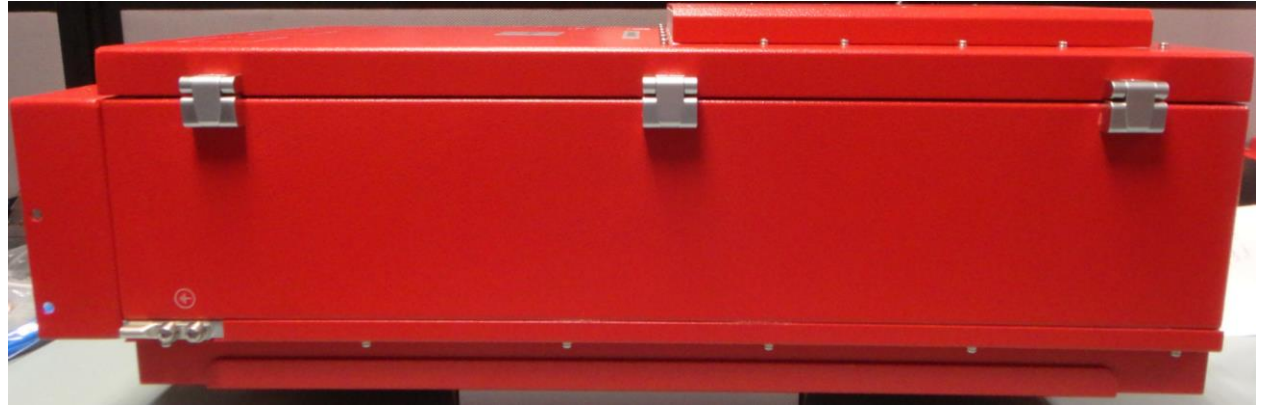
Figure 4: Side view