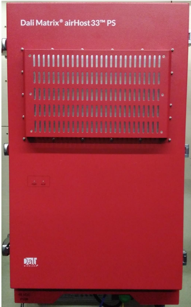
Figure 1: airHost 33 Front view