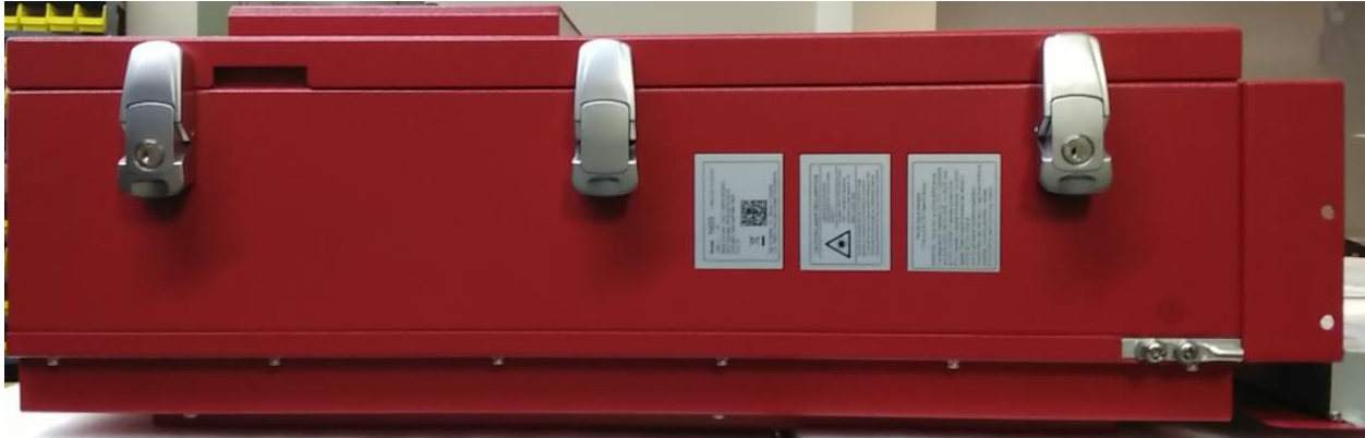
Figure 3: airHost33 Side view (Left)