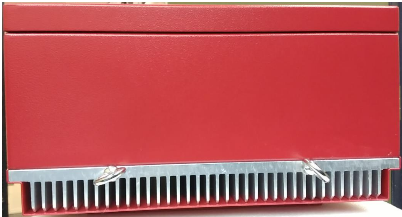
Figure 7: airHost33 Top view