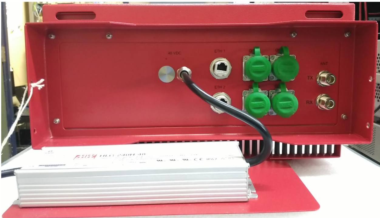
Figure 5: airHost33 Connector panel view