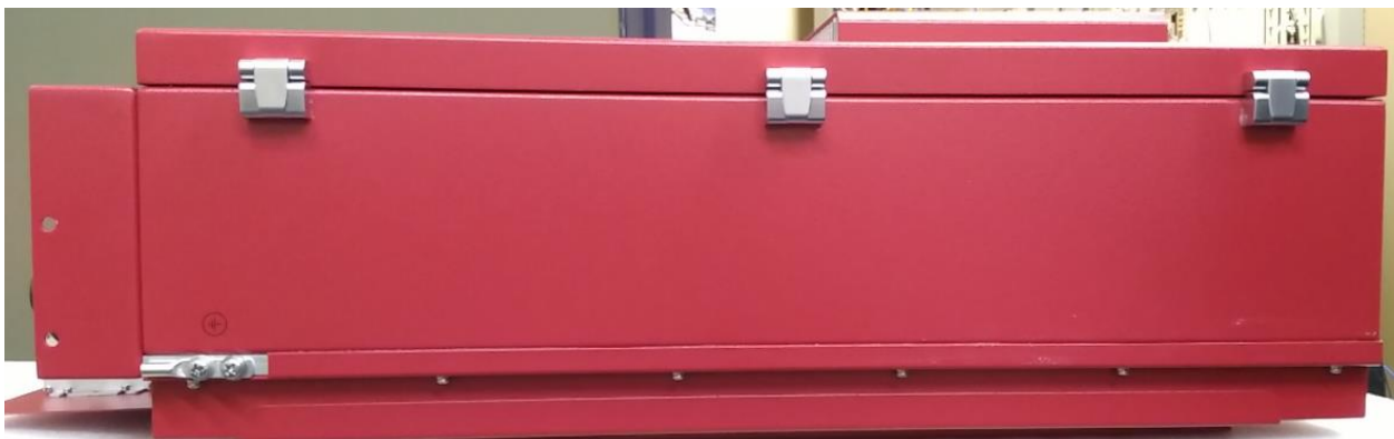
Figure 4: airHost33 Side view (Right)