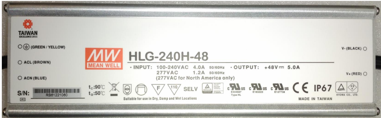
Figure 6: airHost33 Power supply Top view