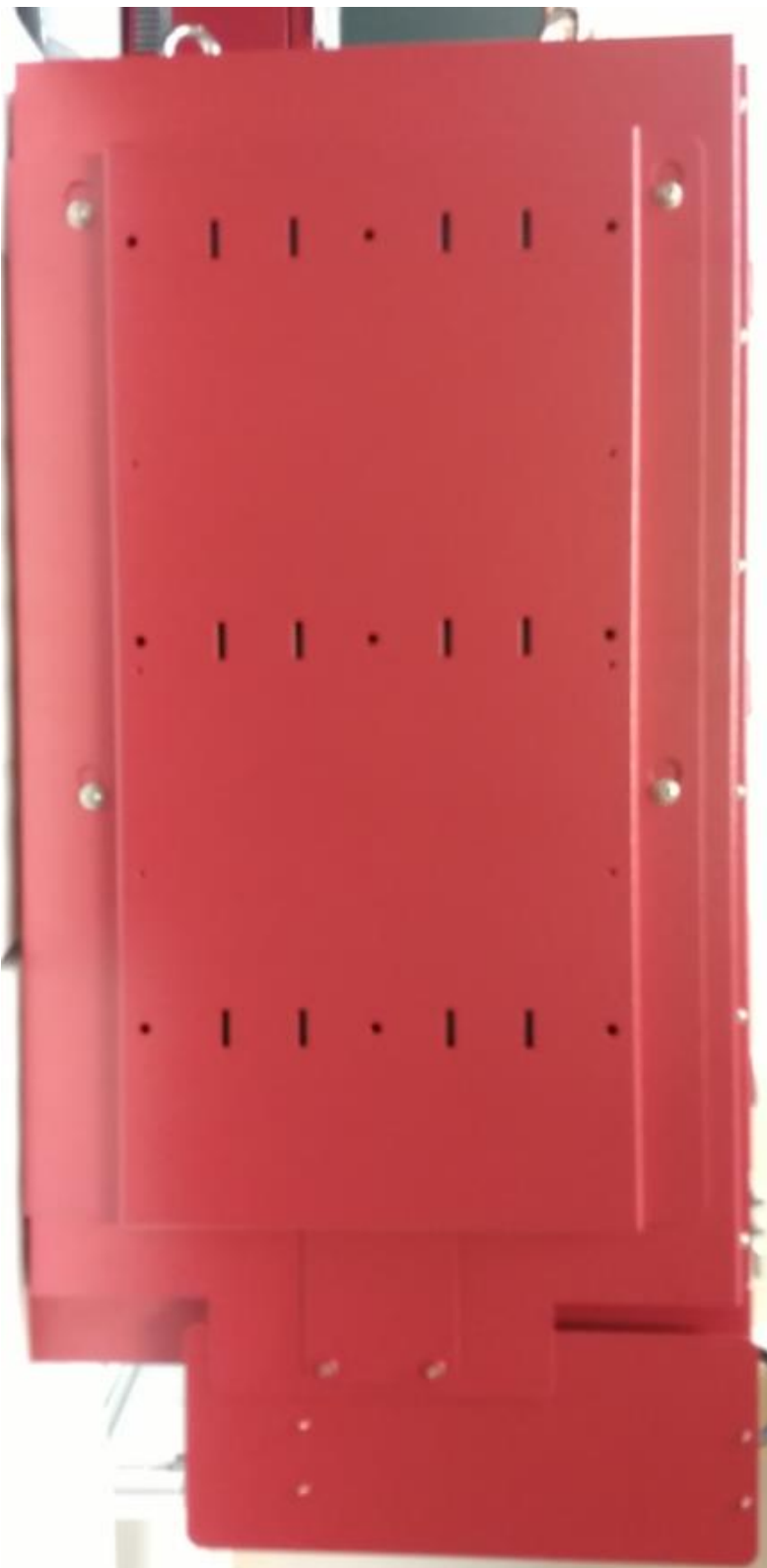
Figure 2: airHost33 Back view