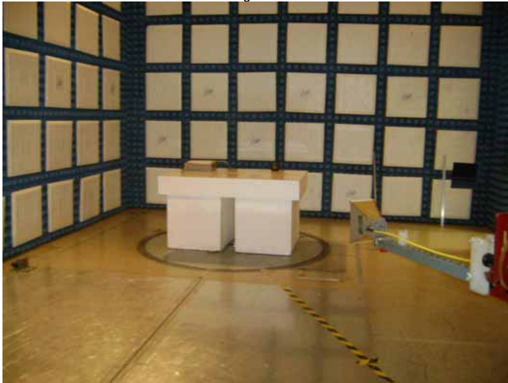
Test Set-up for Radiated Emissions – 1GHz to 10GHz, Horizontal Polarization