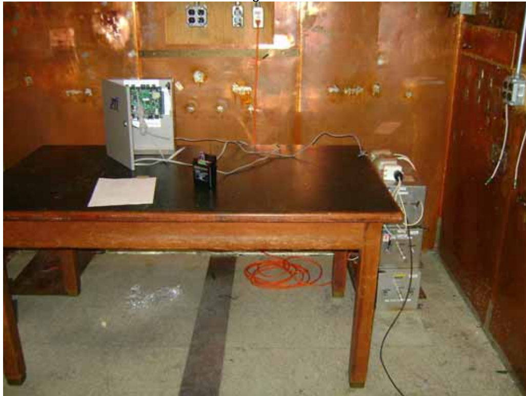
Test Set-up for Conducted Emissions