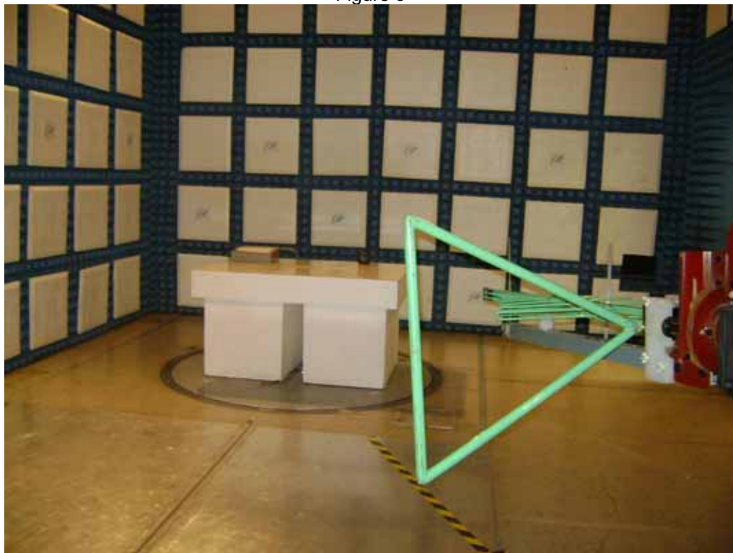
Test Set-up for Radiated Emissions – 30MHz to 1GHz, Horizontal Polarization