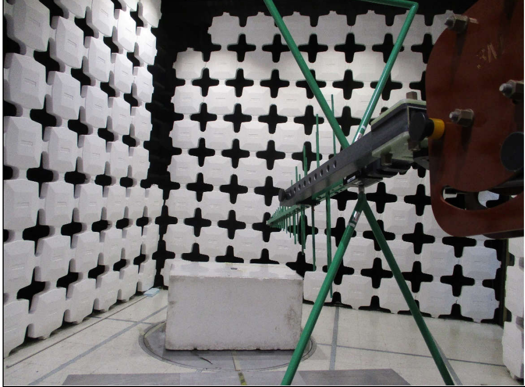
Test Setup for Spurious Radiated Emissions, 30-1000MHz – Antenna Polarization Vertical