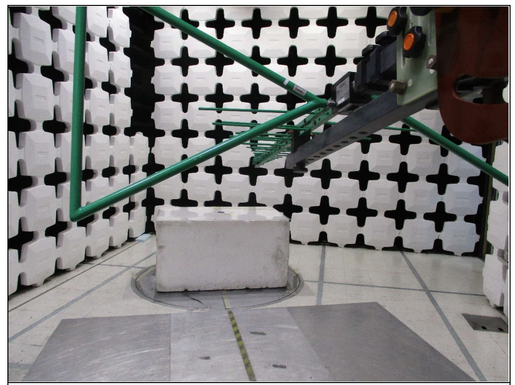
Test Setup for Spurious Radiated Emissions, 30-1000MHz – Antenna Polarization Horizontal