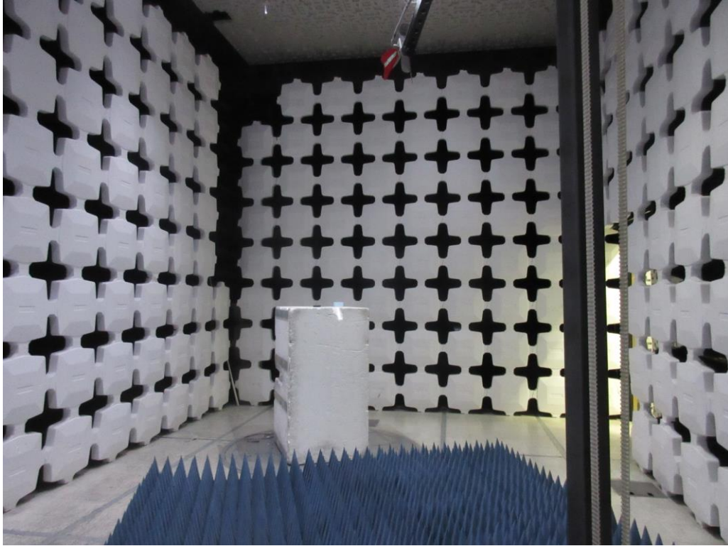
Test Setup for Radiated Emissions, 1 to 4GHz – Horizontal Polarization