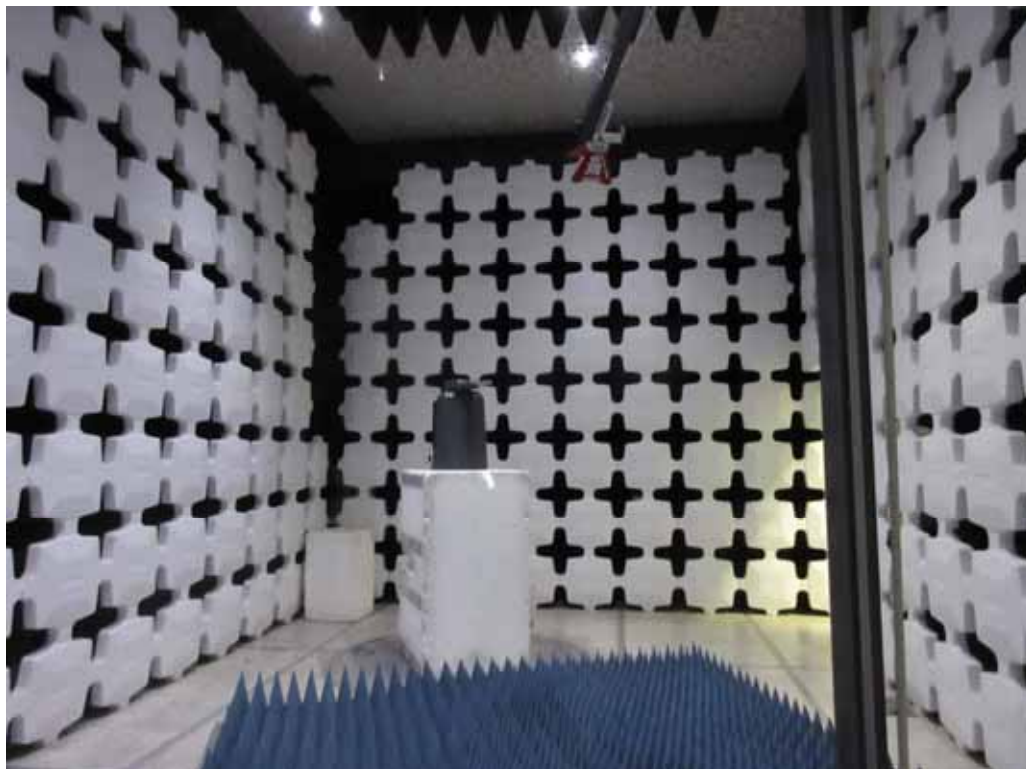
Test Setup for Spurious Emissions – 1 to 10GHz, Vertical Polarization