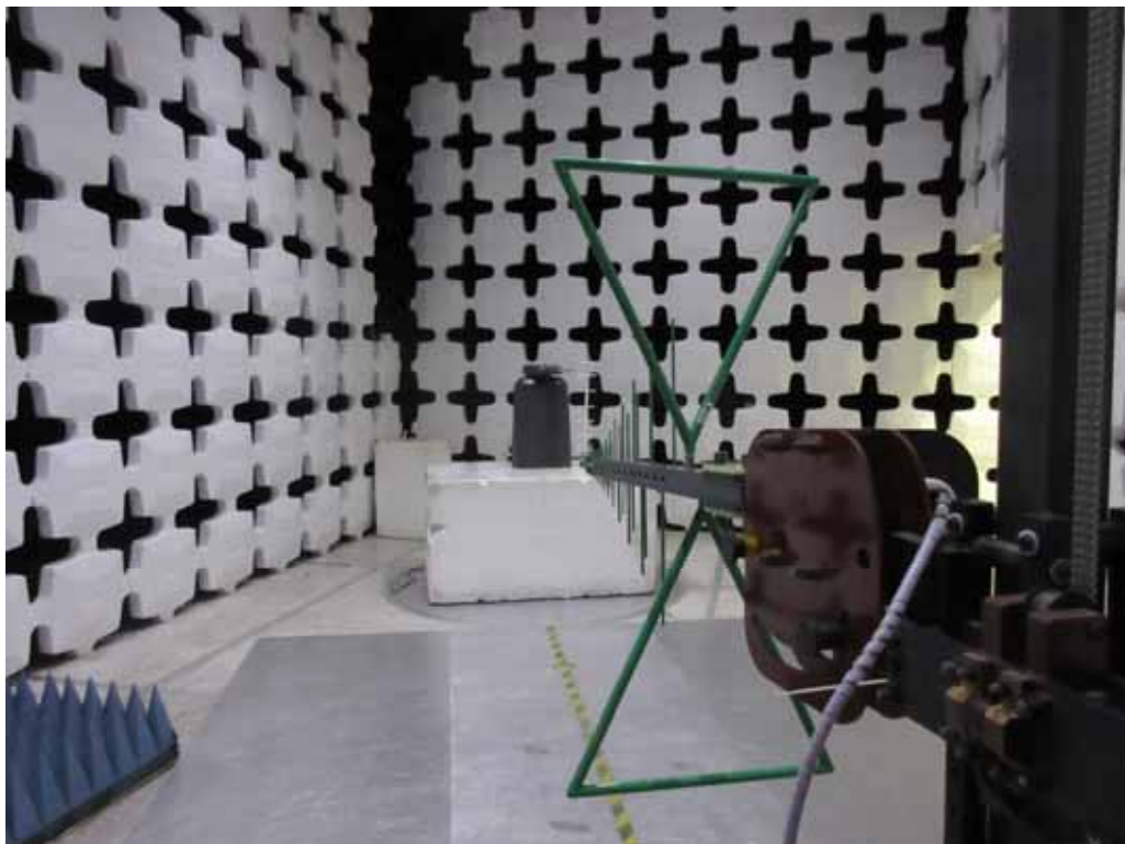
Test Setup for Radiated Emissions – 30MHz to 1GHz, Vertical Polarization