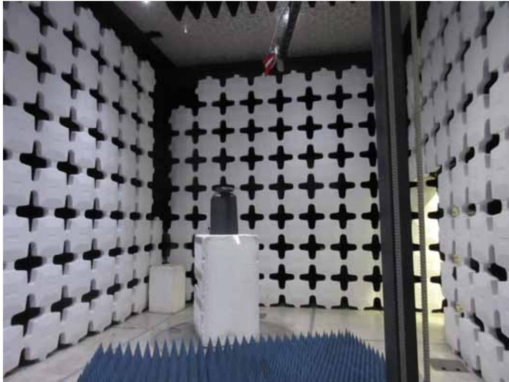
Test Setup for Spurious Emissions – 1 to 10GHz, Horizontal Polarization