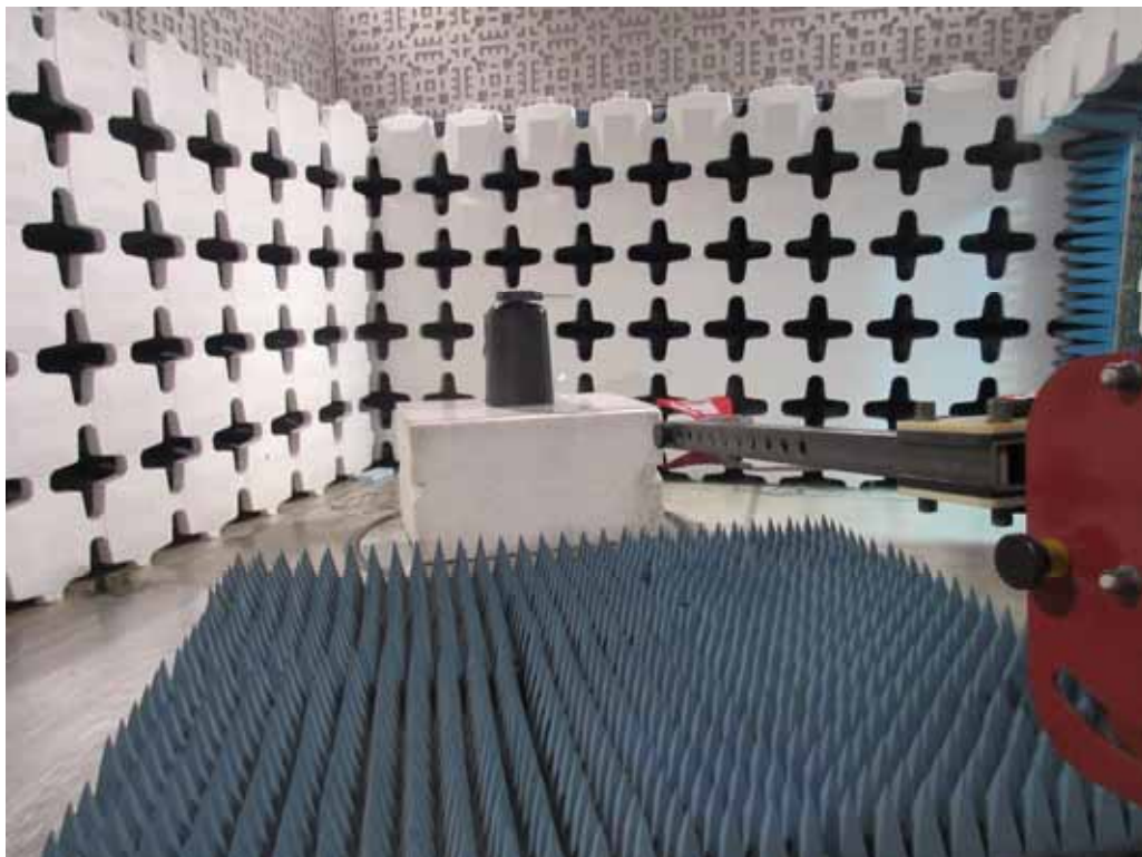
Test Setup for Radiated Emissions – 1 to 10GHz, Vertical Polarization