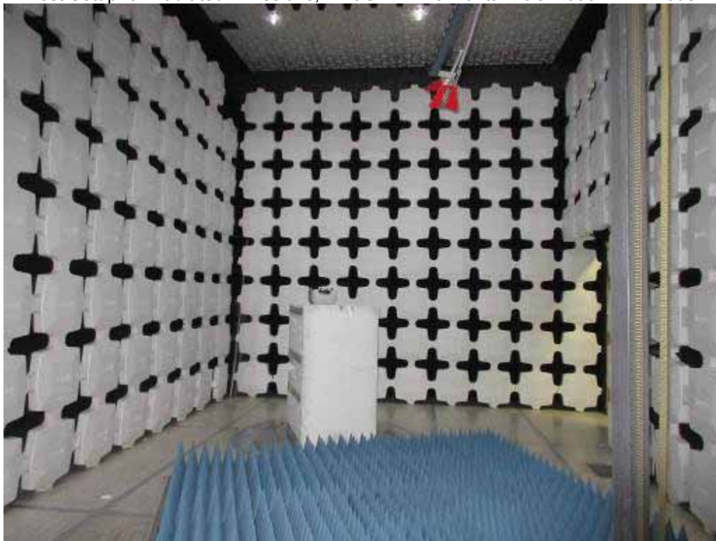
Test Setup for Radiated Emissions, 1-10GHz – Vertical Polarization - Tx Mode