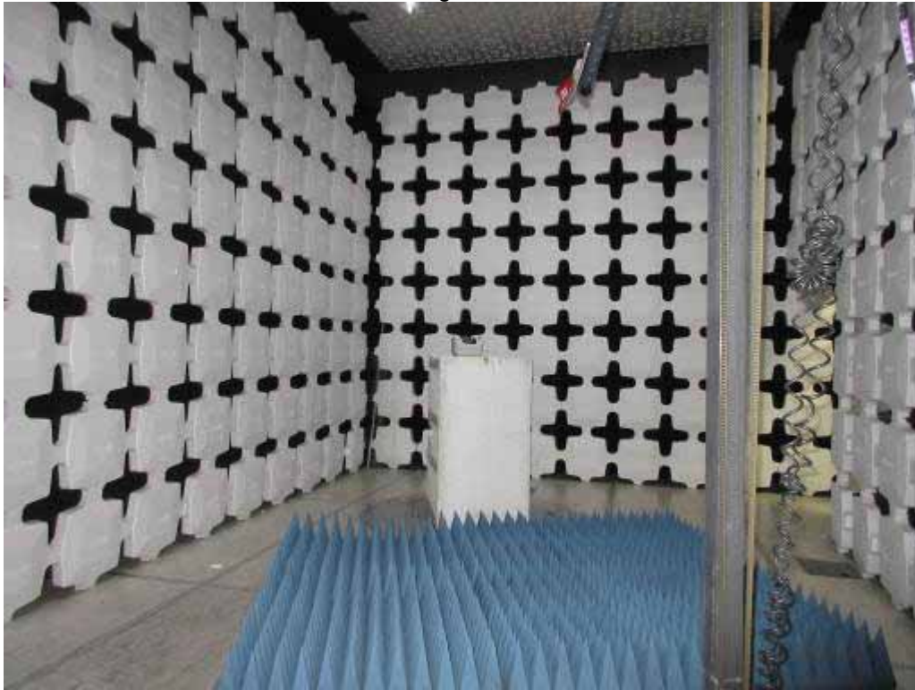
Test Setup for Radiated Emissions, 1-10GHz – Horizontal Polarization - Tx Mode