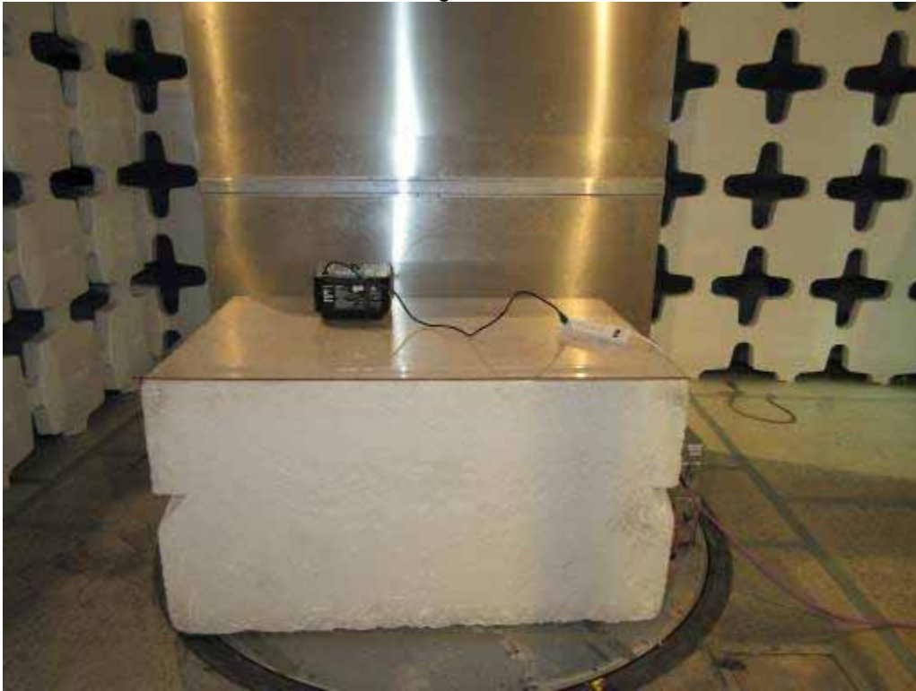
Test Setup for Conducted Emissions