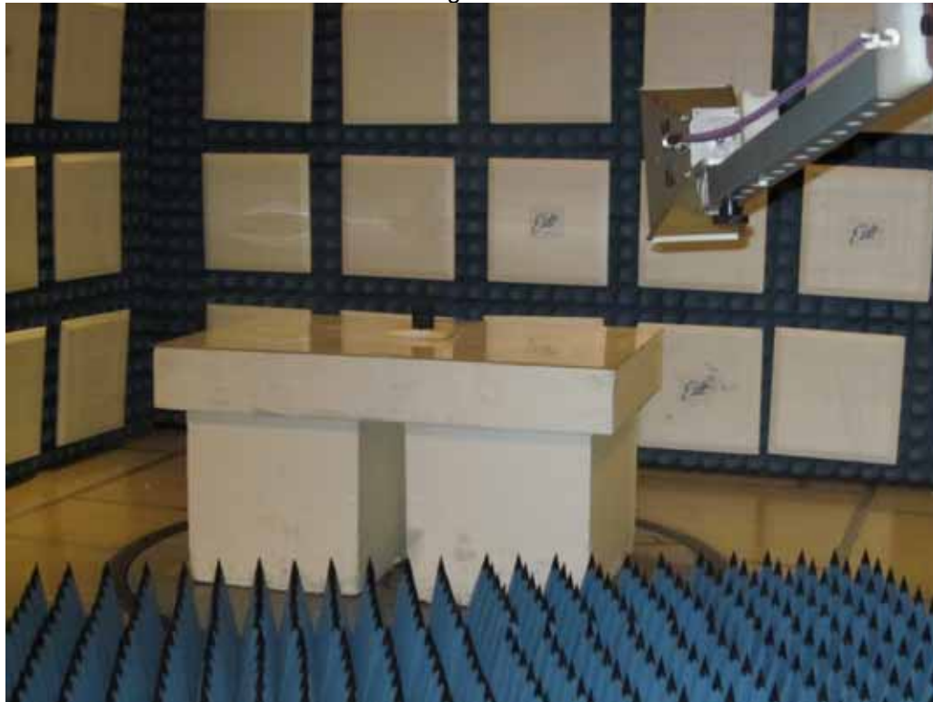
Test Setup for Radiated Emissions – 1GHz to 5GHz, Horizontal Polarization