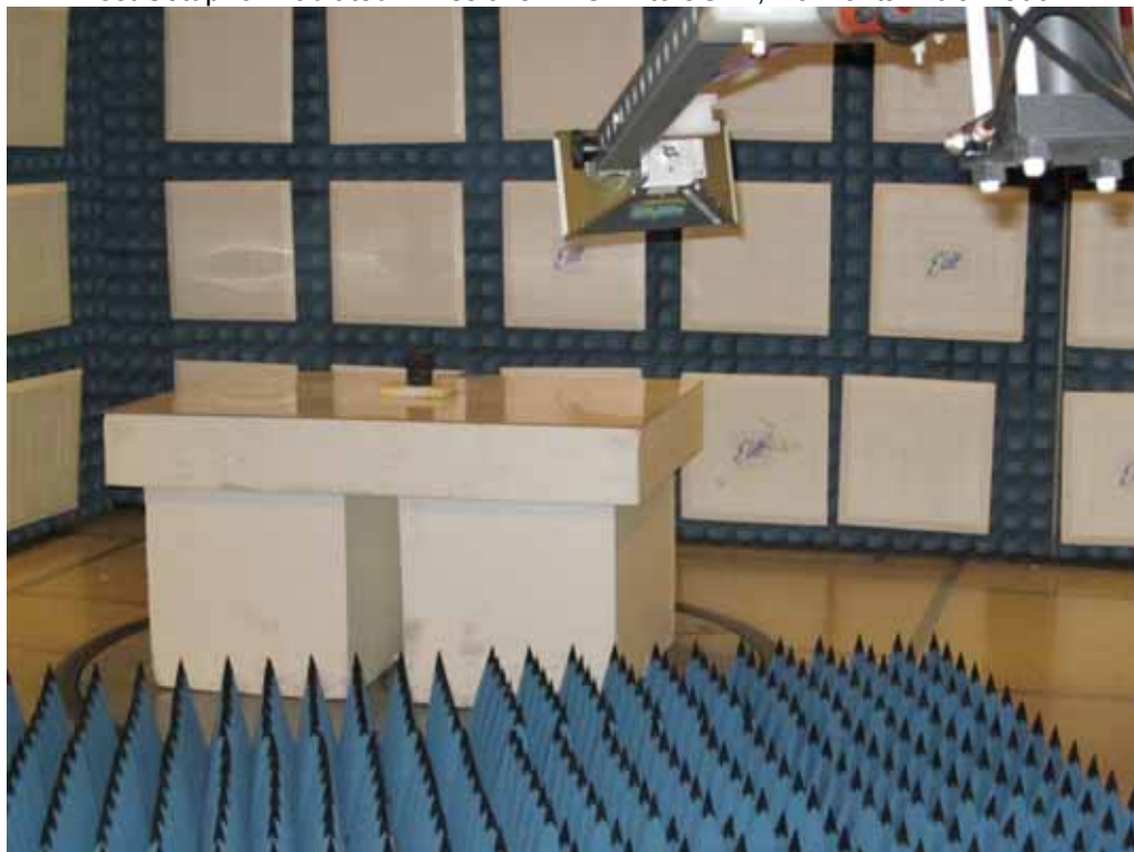
Test Setup for Radiated Emissions – 1GHz to 5GHz, Vertical Polarization