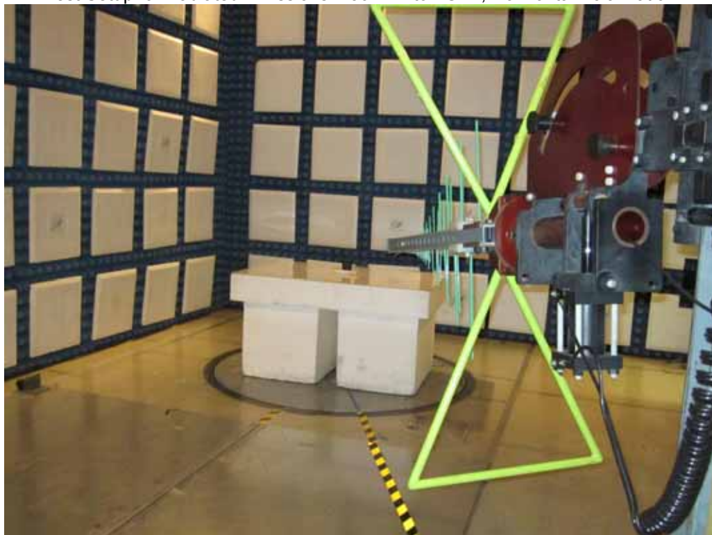
Test Setup for Radiated Emissions – 30MHz to 1GHz, Vertical Polarization