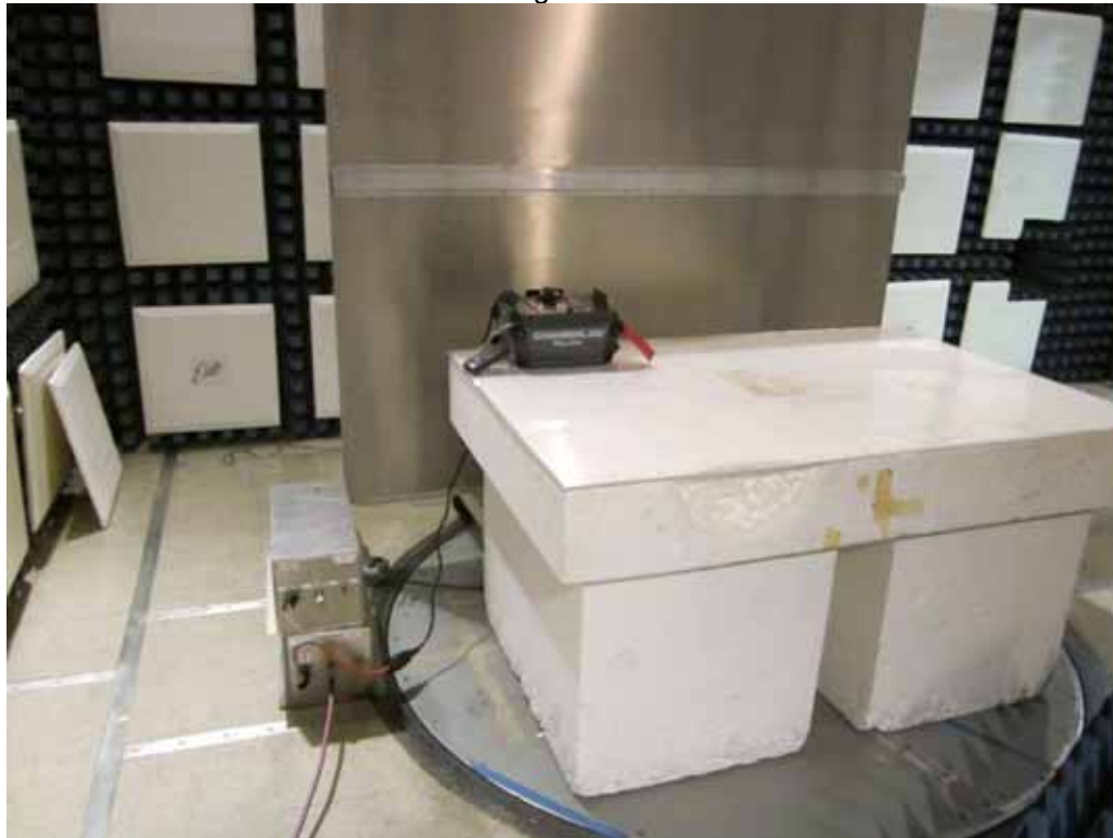
Test Setup for Conducted Emissions