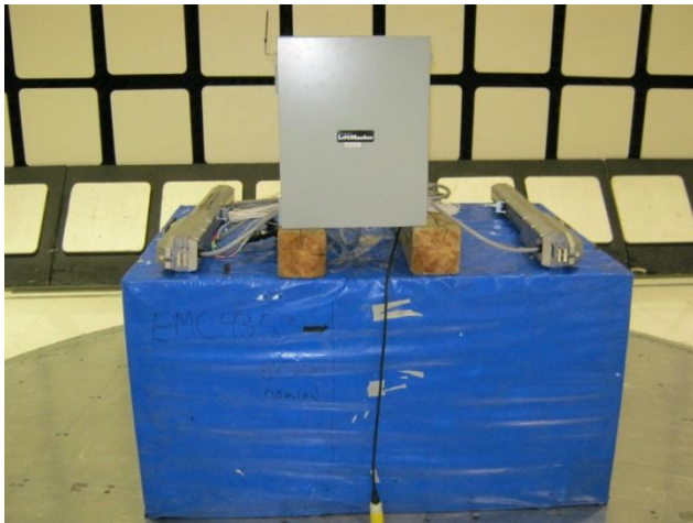
Showing Metal Enclosure