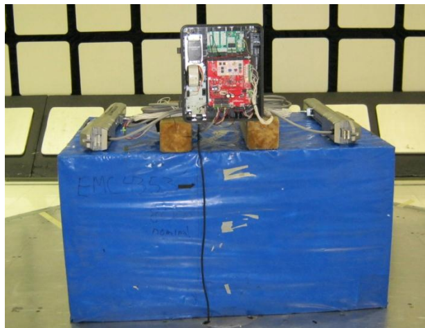
Showing Plastic Enclosure