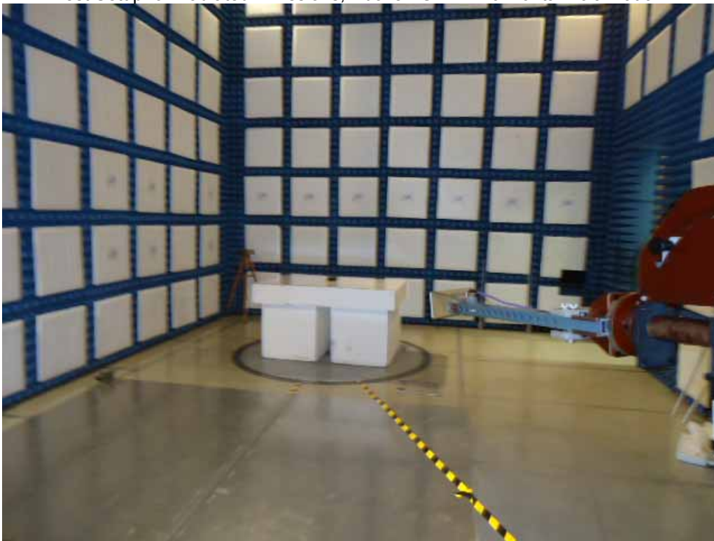
Test Setup for Radiated Emissions, Above 1GHz – Vertical Polarization