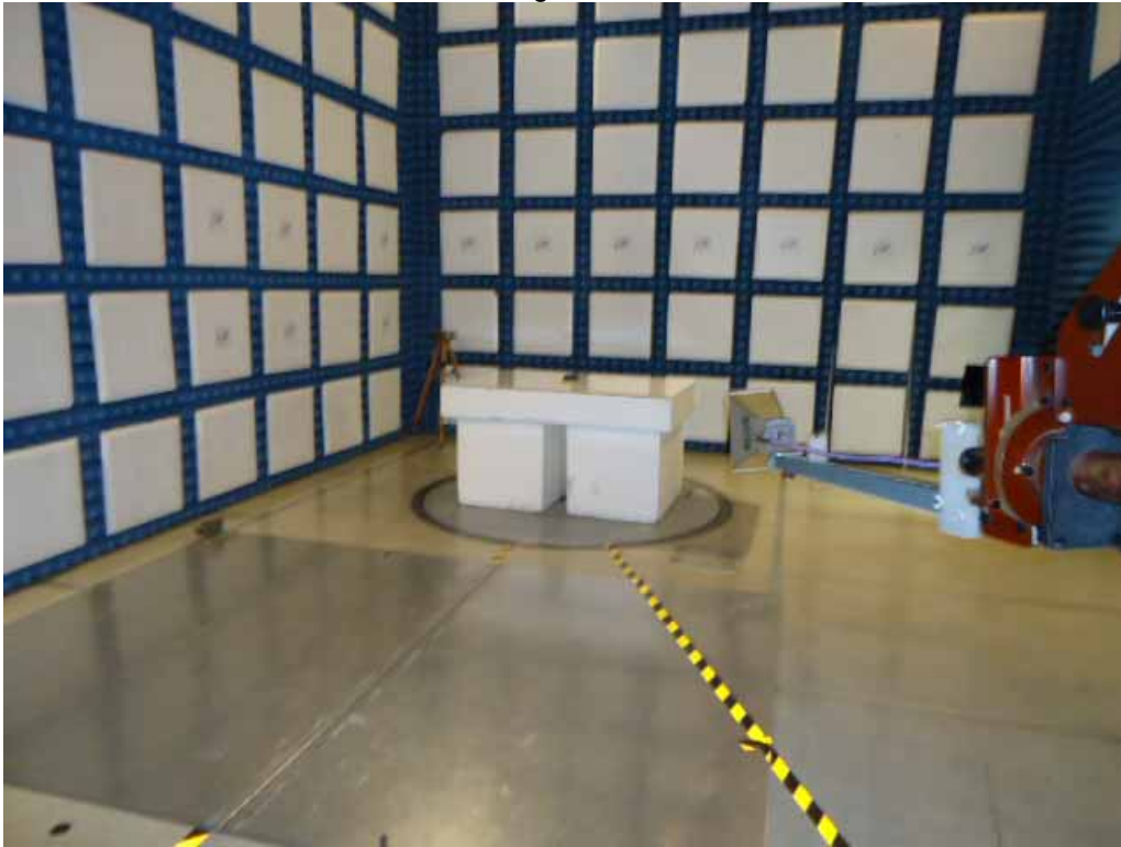
Test Setup for Radiated Emissions, Above 1GHz – Horizontal Polarization