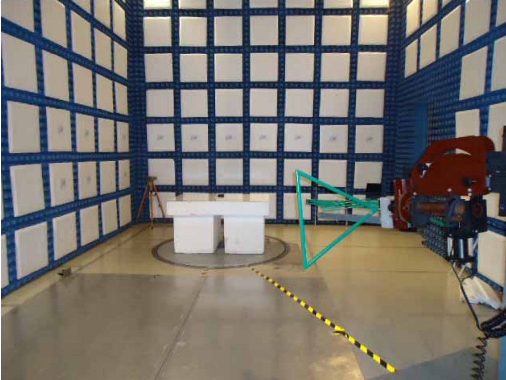
Test Setup for Radiated Emissions, 30MHz to 1GHz – Horizontal Polarization