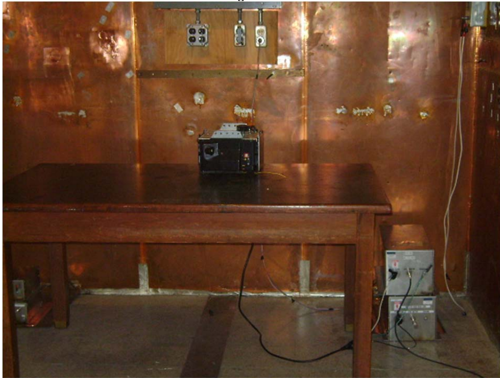
Test Setup for Conducted Emissions