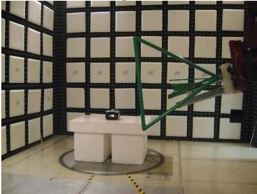
Test Setup for Radiated Emissions – 30MHz to 1GHz, Horizontal Polarization