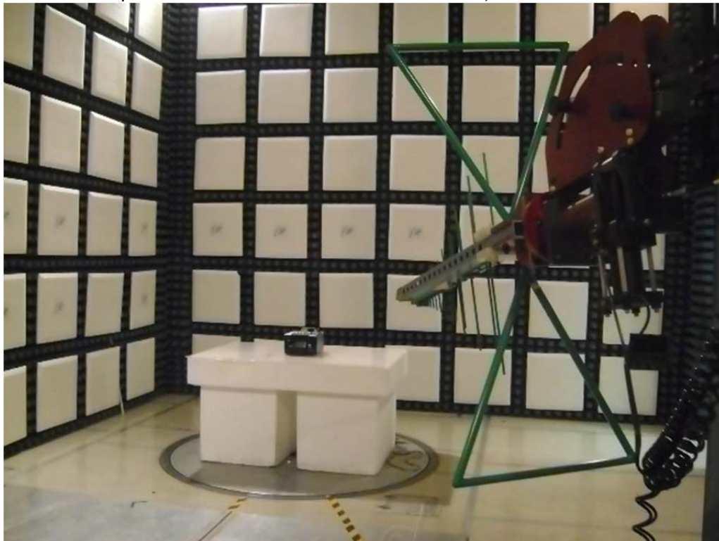
Test Setup for Radiated Emissions – 30MHz to 1GHz, Vertical Polarization