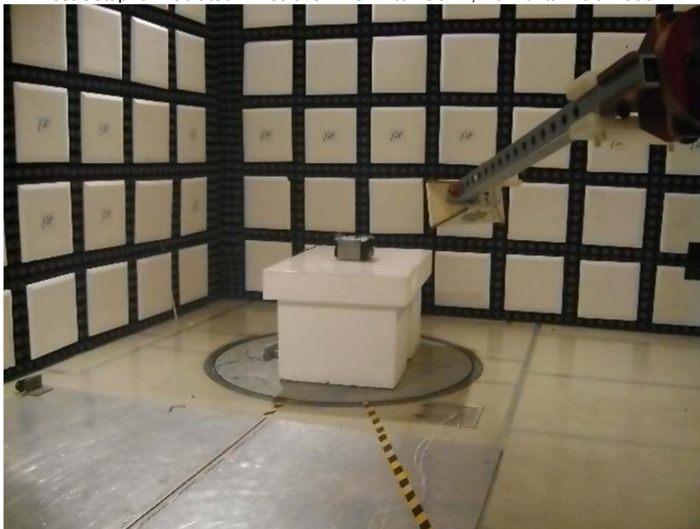
Test Setup for Radiated Emissions – 1GHz to 10GHz, Vertical Polarization