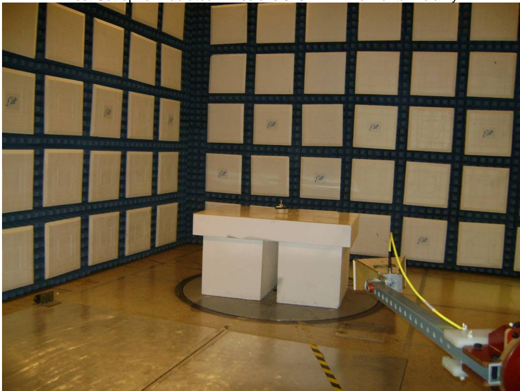
Test Set-up for Radiated Emissions 315MHz – Vertical Polarity