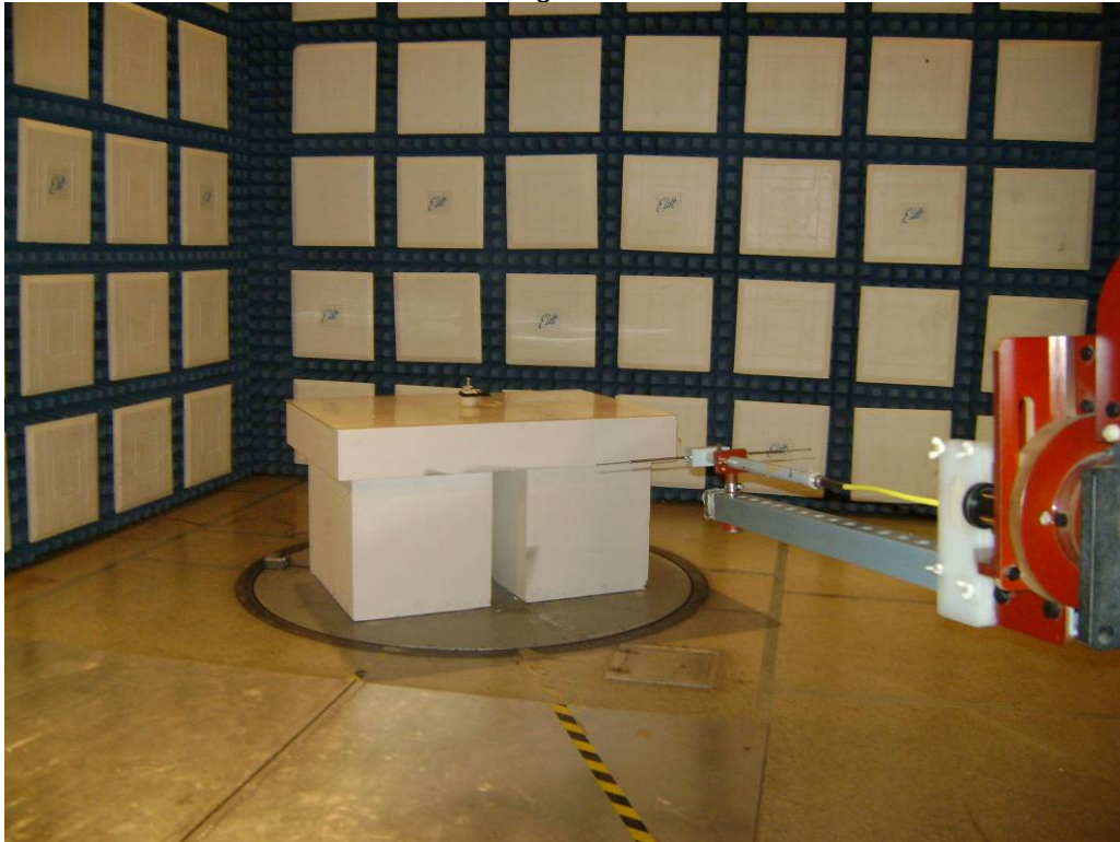
Test Set-up for Radiated Emissions 315Hz – Horizontal Polarity