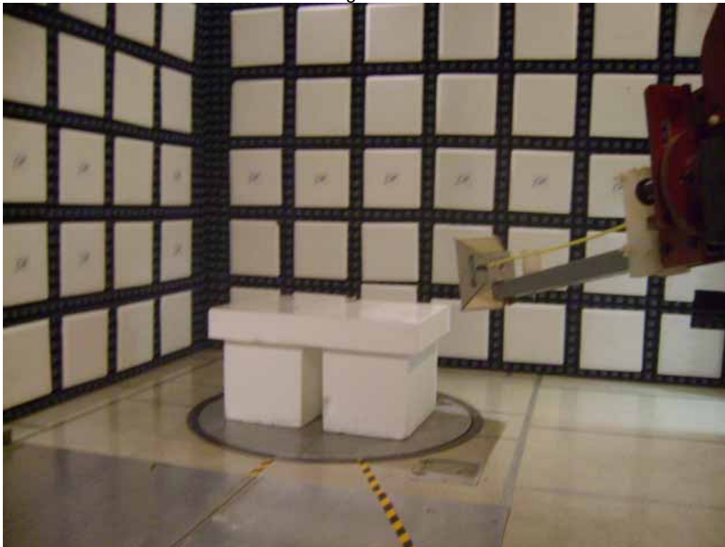
Test Setup for Radiated Emissions, Above 1GHz – Horizontal Polarization