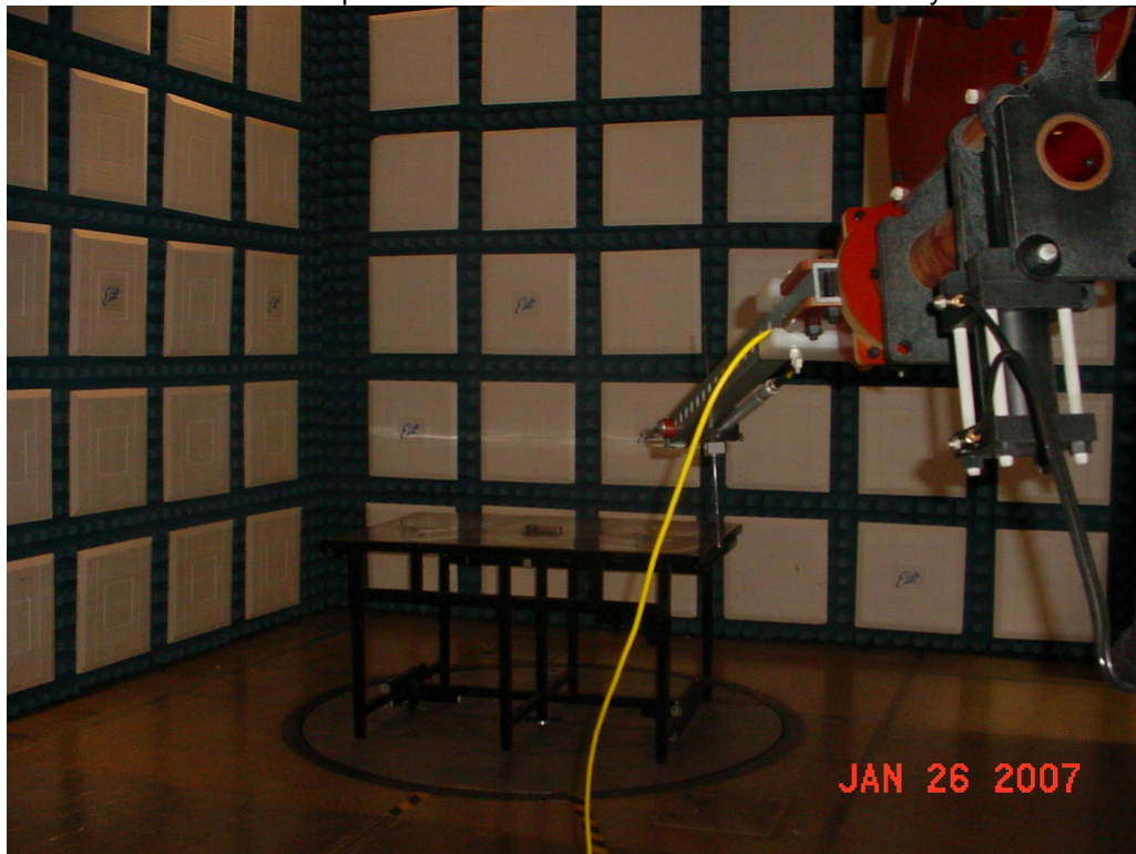
Test Set-up for Radiated Emissions – Vertical Polarity