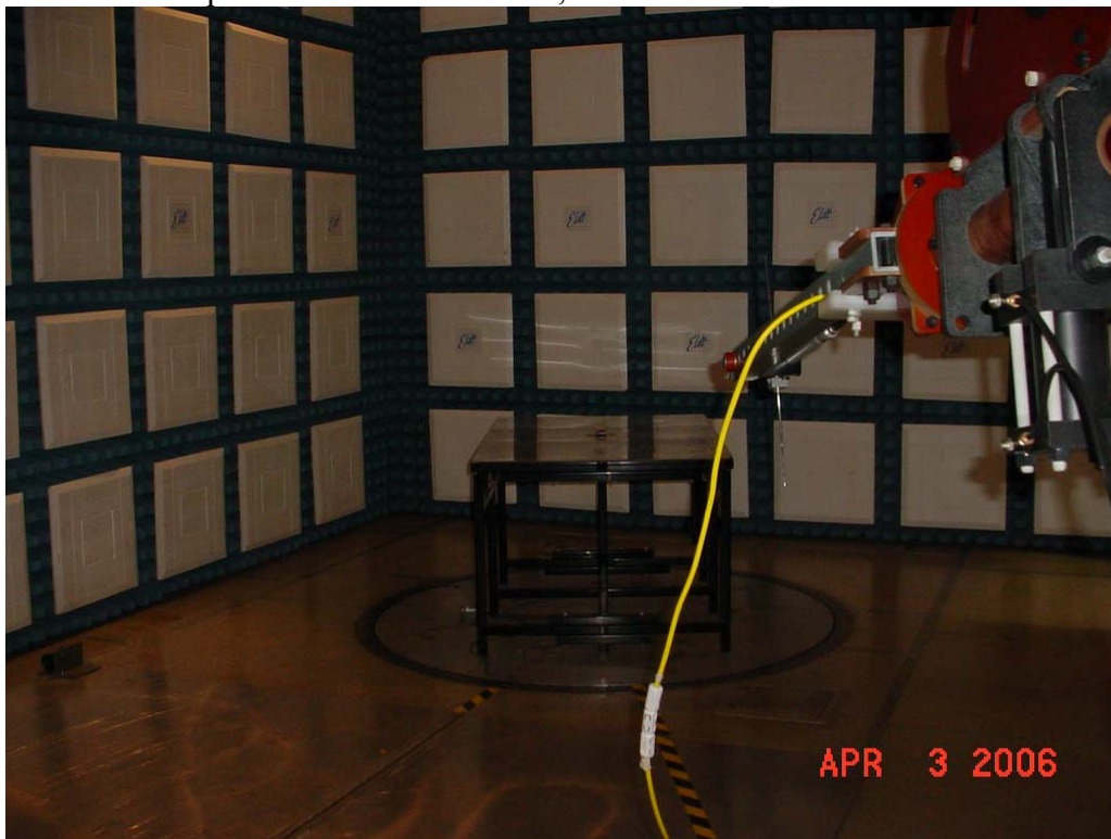
Test Set-up for Radiated Emissions, 300MHz – Vertical Polarization