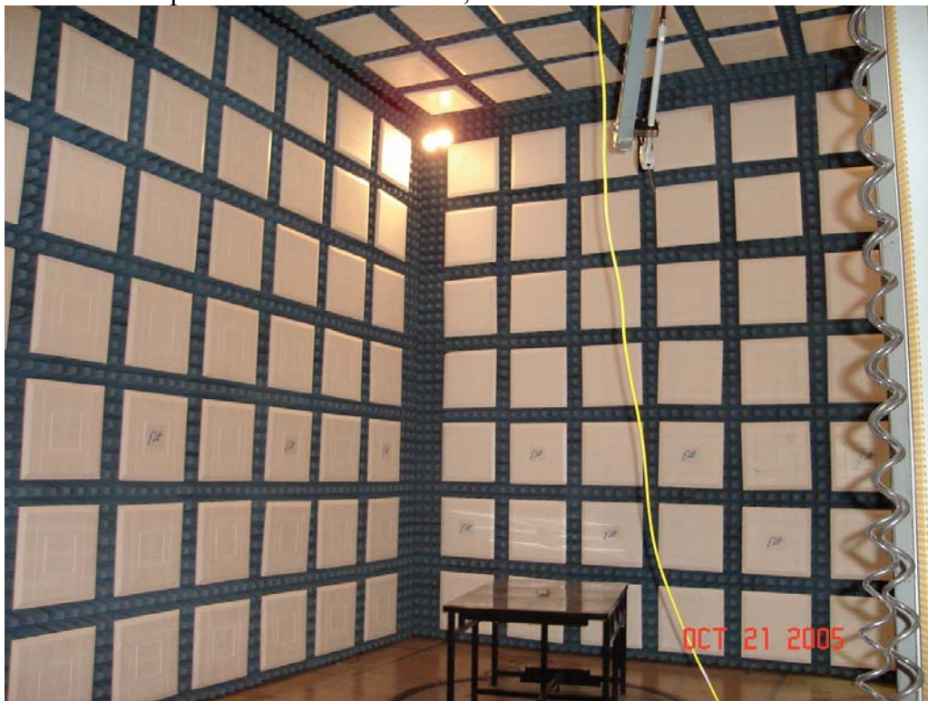
Test Setup for Radiated Emissions, 390MHz - Vertical Polarization