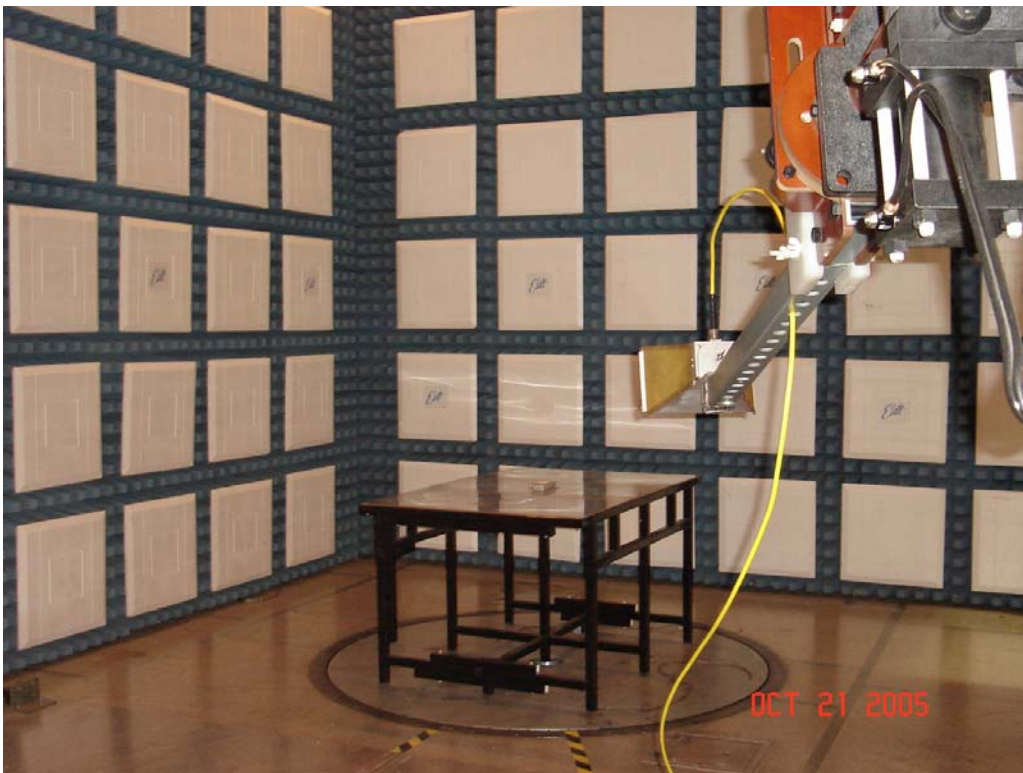
Test Setup for Radiated Emissions, 1GHz to 4GHz – Vertical Polarization