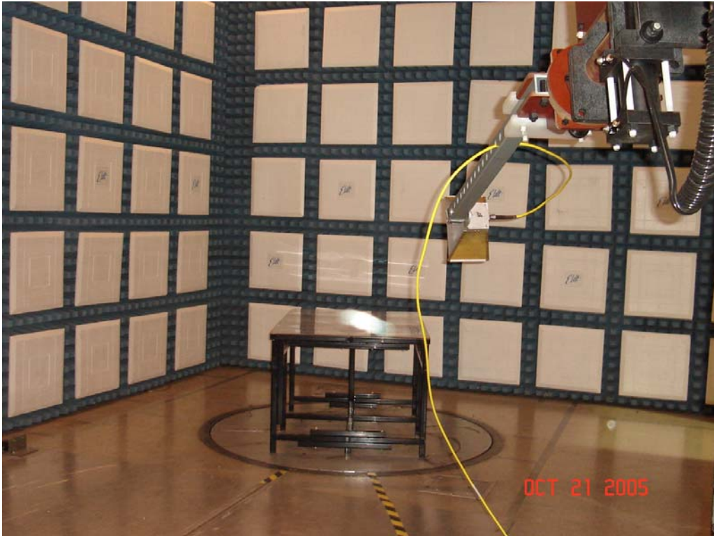
Test Setup for Radiated Emissions, 1GHz to 4GHz – Horizontal Polarization