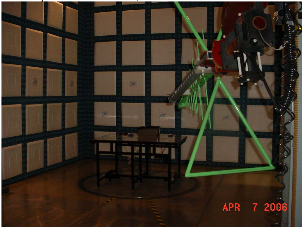
Test Set-up for Radiated Emissions, 30MHz to 1GHz – Vertical Polarization