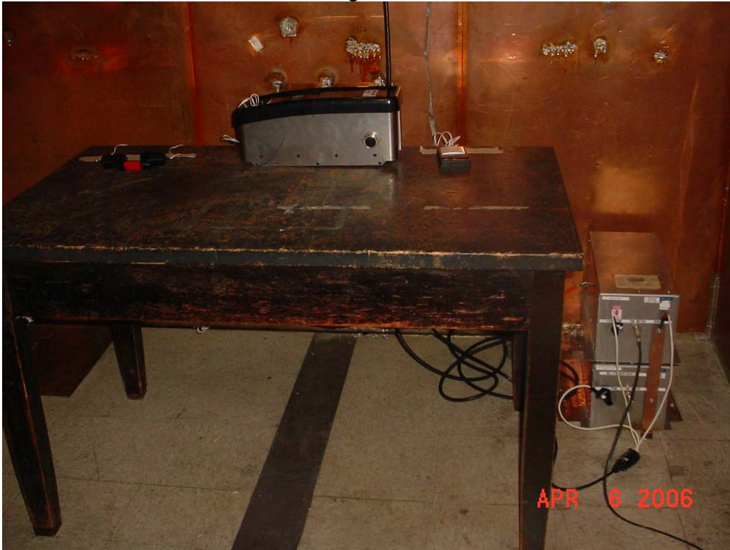
Test Set-up for Conducted Emissions