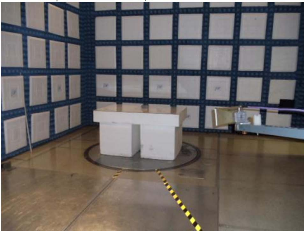
Test Setup for Radiated Emissions, Above 1GHz – Vertical Polarization