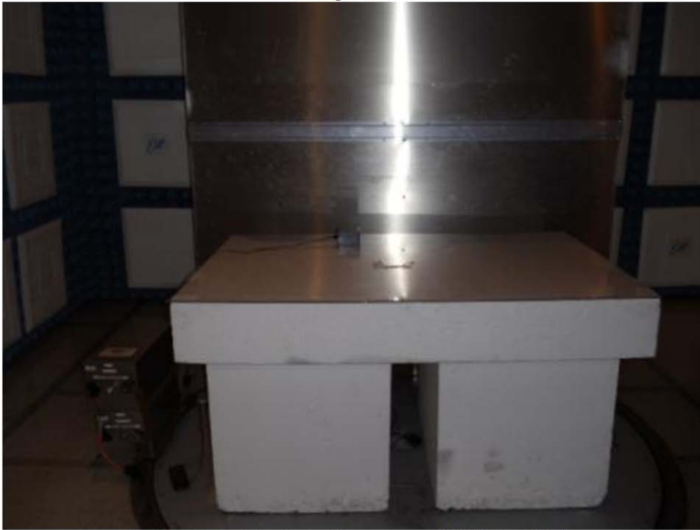
Test Setup for Conducted Emissions, 150kHz to 30MHz