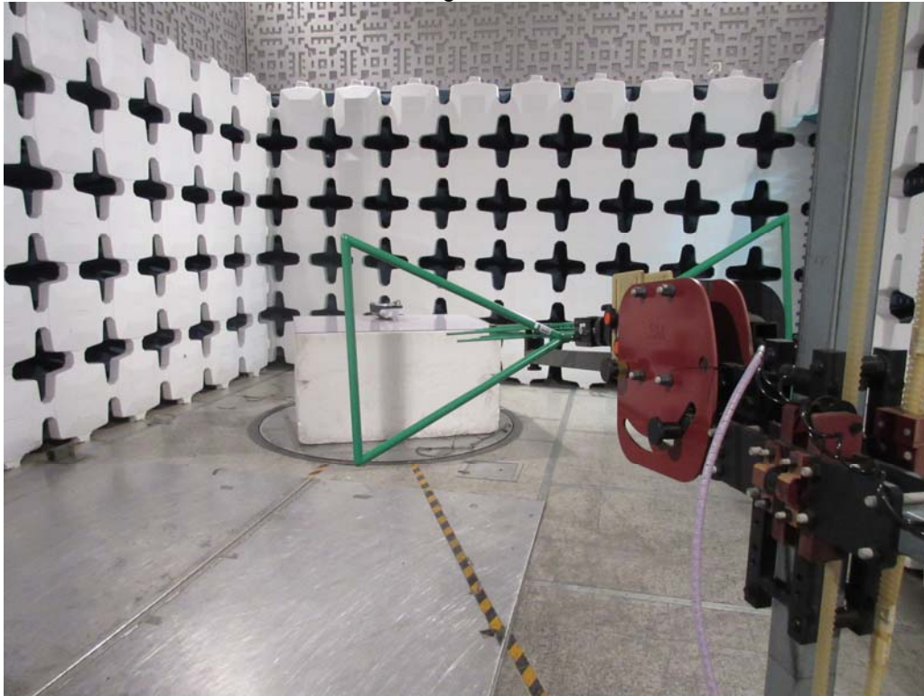
Test Setup for Radiated Emissions, 30MHz to 1GHz – Horizontal Polarization