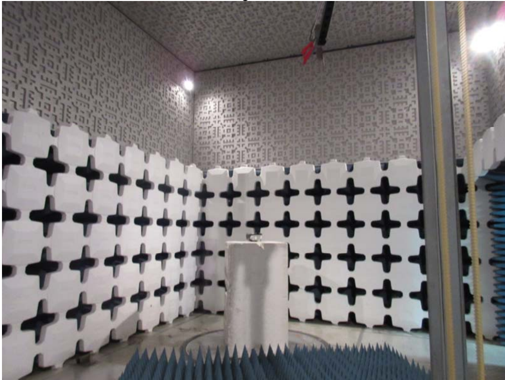
Test Setup for Radiated Emissions, 1 to 5GHz – Horizontal Polarization