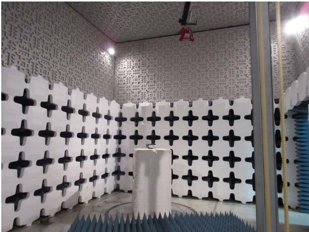
Test Setup for Radiated Emissions, 1 to 5GHz – Vertical Polarization