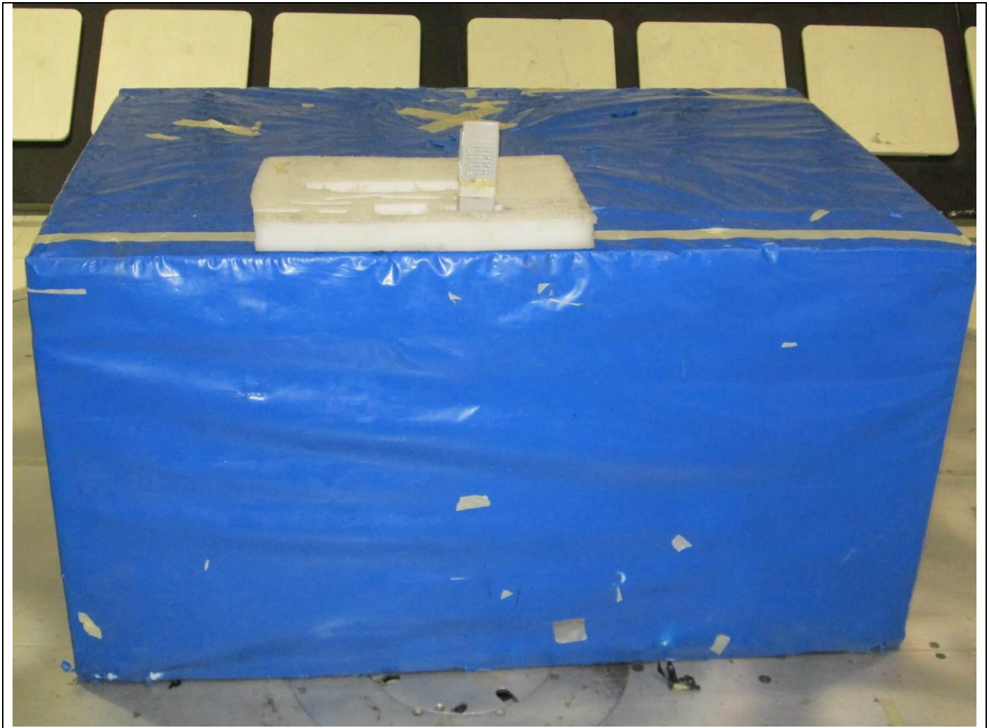
Radiated Emissions Setup