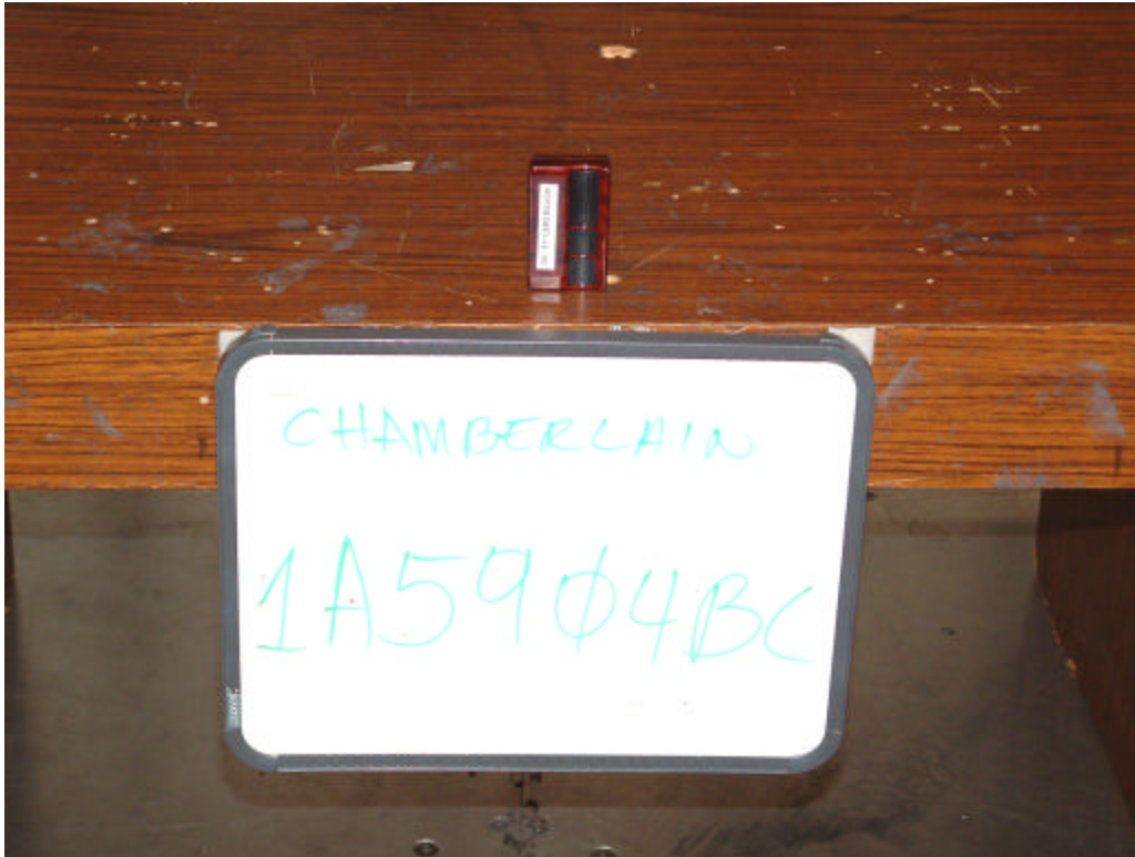
z - axis