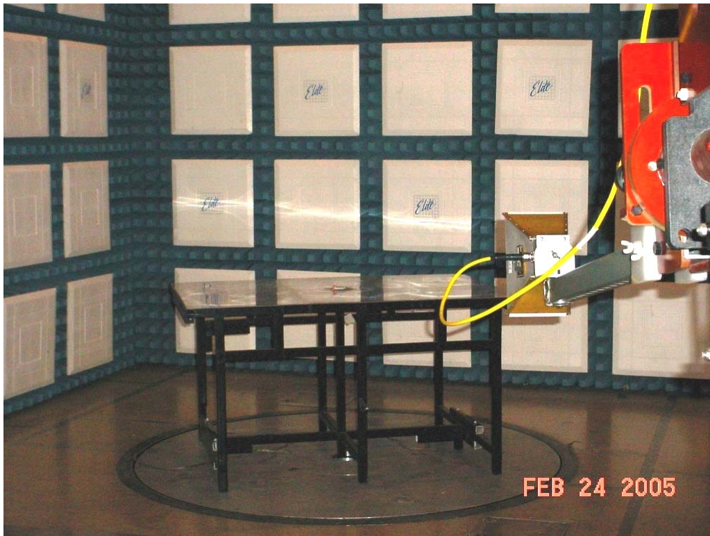
Test Setup for Radiated Emissions Horizontal Polarity