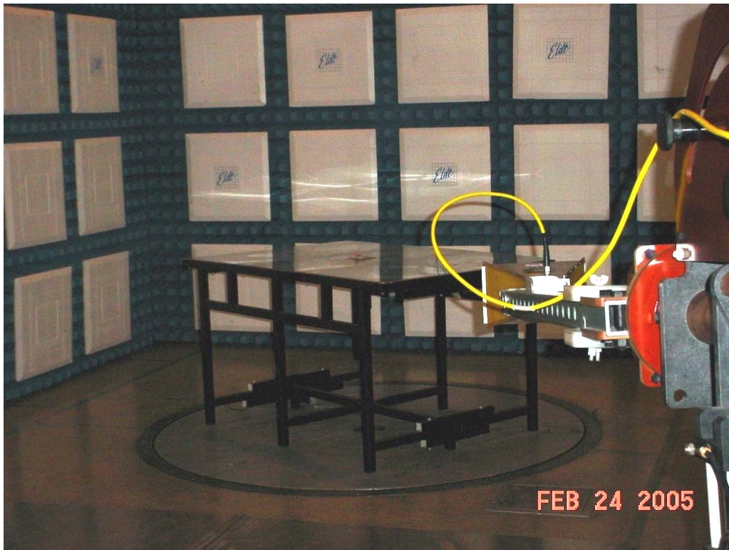
Test Setup for Radiated Emissions Vertical Polarity