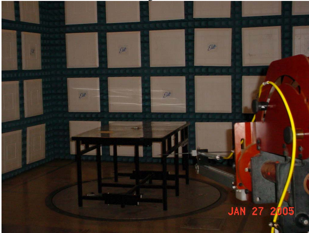
Test Setup for Highest Radiated Emissions Measurement Horizontal Polarity